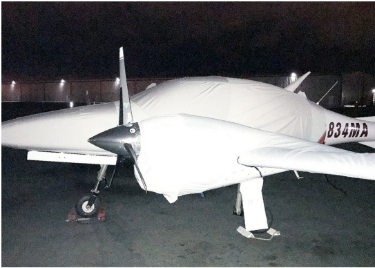
Diamond DA-42 Canopy, Wing, Engine & Horizontal Stabilizer Covers