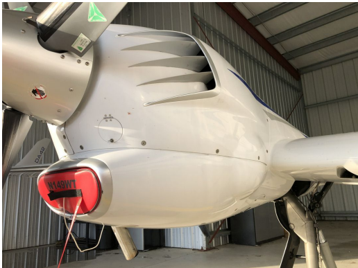
Diamond DA-42 Engine Inlet Plugs

Engine Inlet Plugs are custom fit for your Diamond DA-42 Twin Star intakes, made with heavy-duty vinyl material, and stuffed with a single block of sculpted urethane foam. Each plug has a zipper that allows the foam to be removed and dried if necessary. Engine plugs have warning flags that are visible from the cockpit or 'remove before flight' streamers sewn onto the face of the plugs. Most plugs are imprinted with the aircraft registration number in black for an extra charge. Storage bag NOT included. Engine plugs may be inserted after flight when the engine is still warm. Engine Inlet Plugs are commonly referred to as Cowl Plugs, Intake Plugs, Cowl Blocks, Engine Blocks, and Engine Bungs.