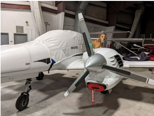
Diamond DA-42 NG Canopy Cover, Engine Plugs