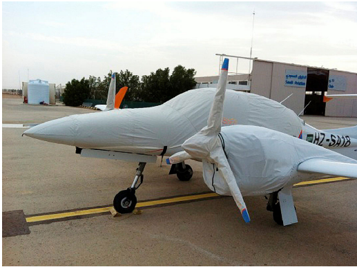
Diamond DA-42NG Canopy/Nose, Engine & Prop Covers

The material is very reflective, and tests show that the cabin interior temperature can be reduced to near-ambient temperature on the hottest of days. It is water, ice and snow repellent, yet breathable to allow moisture to escape from between the cover and the aircraft surface.