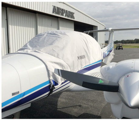
Diamond DA-42 Twin Star Canopy Cover