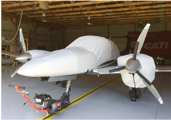
Diamond DA-42-VI Canopy/Nose & Engine Covers