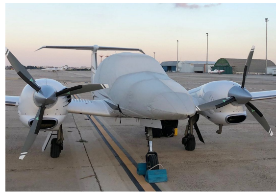
Diamond DA-42 Canopy/Nose Cover