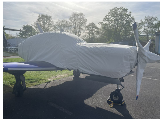
Diamond DA-50 Extended Canopy/Engine, Prop & Wing Covers (test fit)