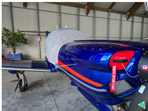
Diamond DA-50 Canopy Cover, Engine Plugs

Engine Inlet Plugs are custom fit for your Diamond DA-50 Superstar intakes, made with heavy-duty vinyl material, and stuffed with a single block of sculpted urethane foam. Each plug has a zipper that allows the foam to be removed and dried if necessary. Engine plugs have warning flags that are visible from the cockpit or 'remove before flight' streamers sewn onto the face of the plugs. Most plugs are imprinted with the aircraft registration number in black for an extra charge. Storage bag NOT included. Engine plugs may be inserted after flight when the engine is still warm. Engine Inlet Plugs are commonly referred to as Cowl Plugs, Intake Plugs, Cowl Blocks, Engine Blocks, and Engine Bungs.