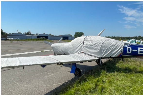
Diamond DA-50 Extended Canopy/Engine Cover, Wing Covers

WINTER USE MATERIAL - Made with Solution-Dyed Polyester fabric, this option is intended for seasonal use to aid in deicing, rain mitigation, or for occasional travel. The material is lighter and more compact, but more susceptible to UV damage and may have a shorter useful life if used continuously outside than the all-year use material.