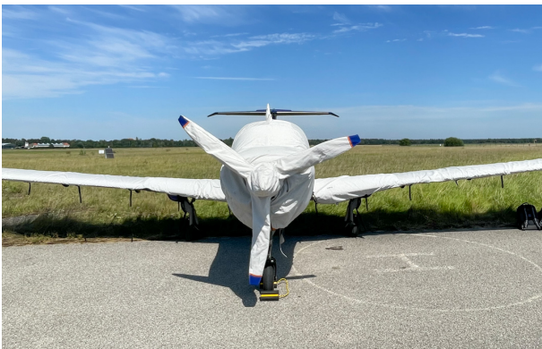
Diamond DA-50 Extended Canopy/Engine Cover, Wing & Prop Covers