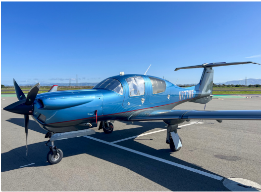
Diamond DA-50 HeatShield Set