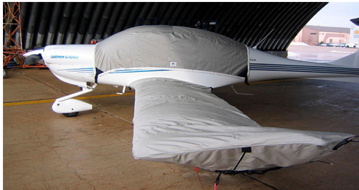
Diamond DA-40 Canopy & Wing Covers

This cover type is made from Silver Acrylic Sunbrella canvas and is 100% lined with a soft and smooth microfiber. Bruce's Custom Covers developed this material combination especially for aircraft protection. The outer material is medium weight and treated for water resistance, UV resistance and anti-static buildup. The inner lining is a very soft and smooth microfiber to prevent scratching. The material is very reflective, and tests show that the cabin interior temperature can be reduced to near-ambient temperature on the hottest of days. It is water, ice and snow repellent, yet breathable to allow moisture to escape from between the cover and the aircraft surface.