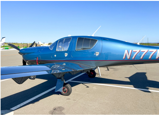
Diamond DA-50 HeatShield Set

Cabin Heatshields are interior sunshades for the aircraft's passenger cabin area. The product is a unique composite of closed-cell foam with a silver mylar finish. The semi-rigid design is stiff enough to stand inside the window framing. The set folds up flat and is easily stored in the included storage sleeve. Some designs may require velcro and suction cups. A Heatshield is an excellent short-term remedy for cockpit overheating, but an external fabric cover is more effective for long-term protection.