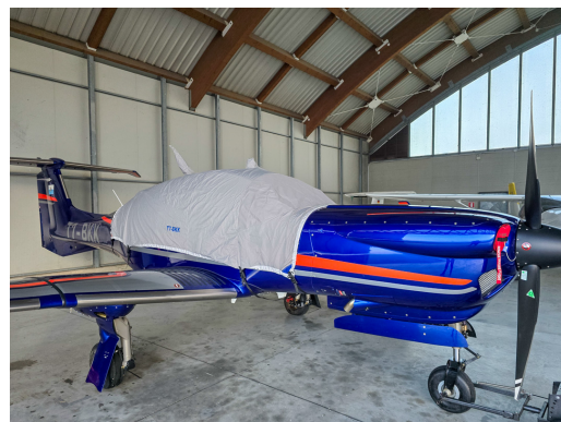
Diamond DA-50 Canopy Cover, Engine Plugs