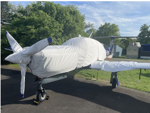
Diamond DA-50 Extended Canopy/Engine, Prop & Wing Covers (test fit)