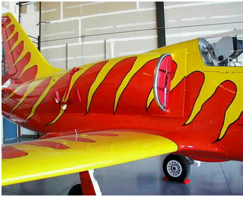
Inlet Plug, folding type