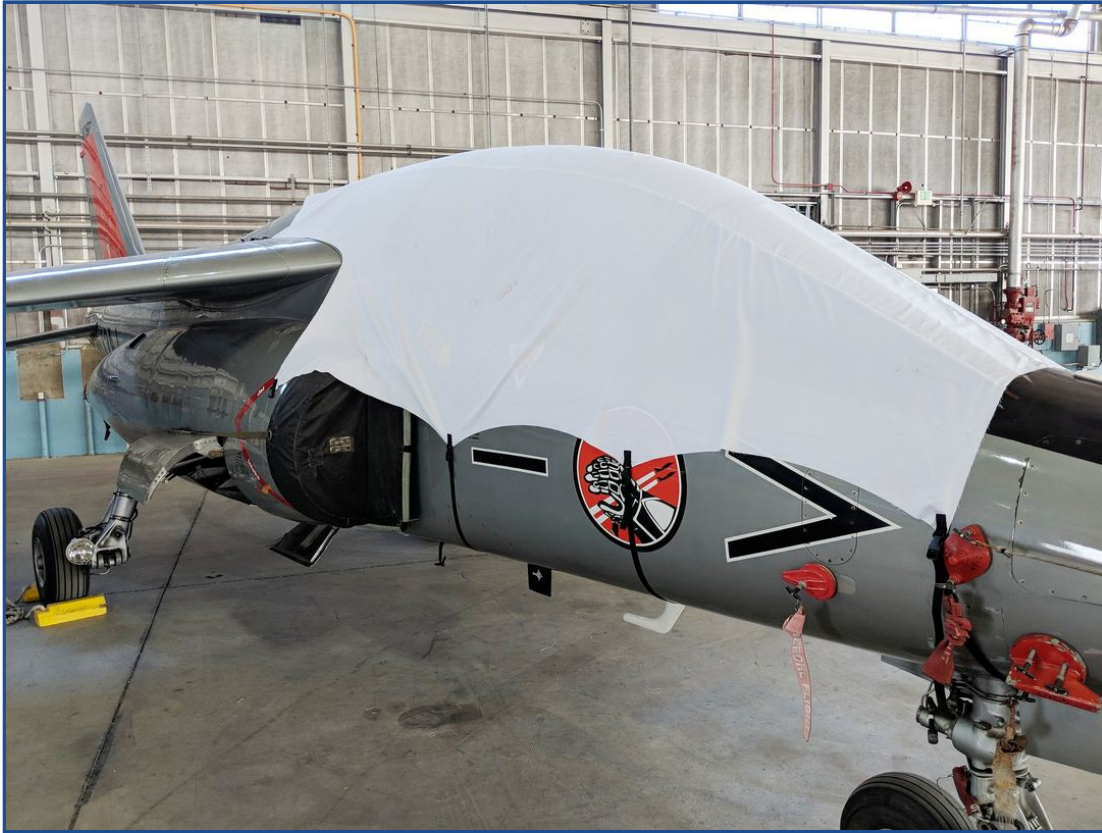
Dornier Alpha Jet Canopy Cover, test fit cover