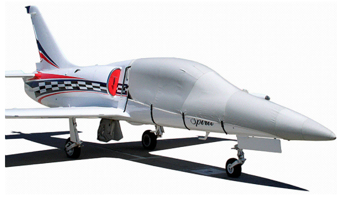
L39 Canopy/Nose Cover & Intake Plugs