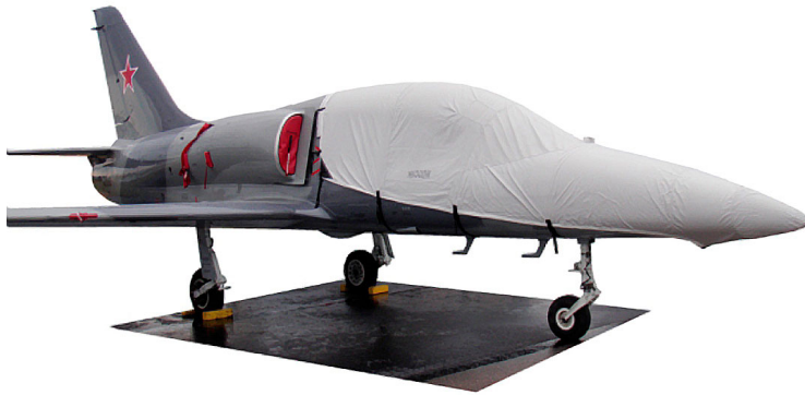
L-39 Canopy/Nose Cover & Plugs

This cover type is made from Silver Acrylic Sunbrella canvas and is 100% lined with a soft and smooth microfiber. Bruce's Custom Covers developed this material combination especially for aircraft protection. The outer material is medium weight and treated for water resistance, UV resistance and anti-static buildup. The inner lining is a very soft and smooth microfiber to prevent scratching. The material is very reflective, and tests show that the cabin interior temperature can be reduced to near-ambient temperature on the hottest of days. It is water, ice and snow repellent, yet breathable to allow moisture to escape from between the cover and the aircraft surface.