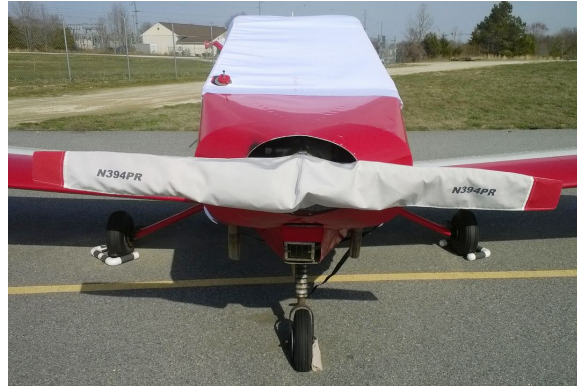
Davis DA-2A Propellor/Spinner Cover

This cover type is made from Silver Acrylic Sunbrella canvas and is 100% lined with a soft and smooth microfiber. Bruce's Custom Covers developed this material combination especially for aircraft protection. The outer material is medium weight and treated for water resistance, UV resistance and anti-static buildup. The inner lining is a very soft and smooth microfiber to prevent scratching. The material is very reflective, and tests show that the cabin interior temperature can be reduced to near-ambient temperature on the hottest of days. It is water, ice and snow repellent, yet breathable to allow moisture to escape from between the cover and the aircraft surface.