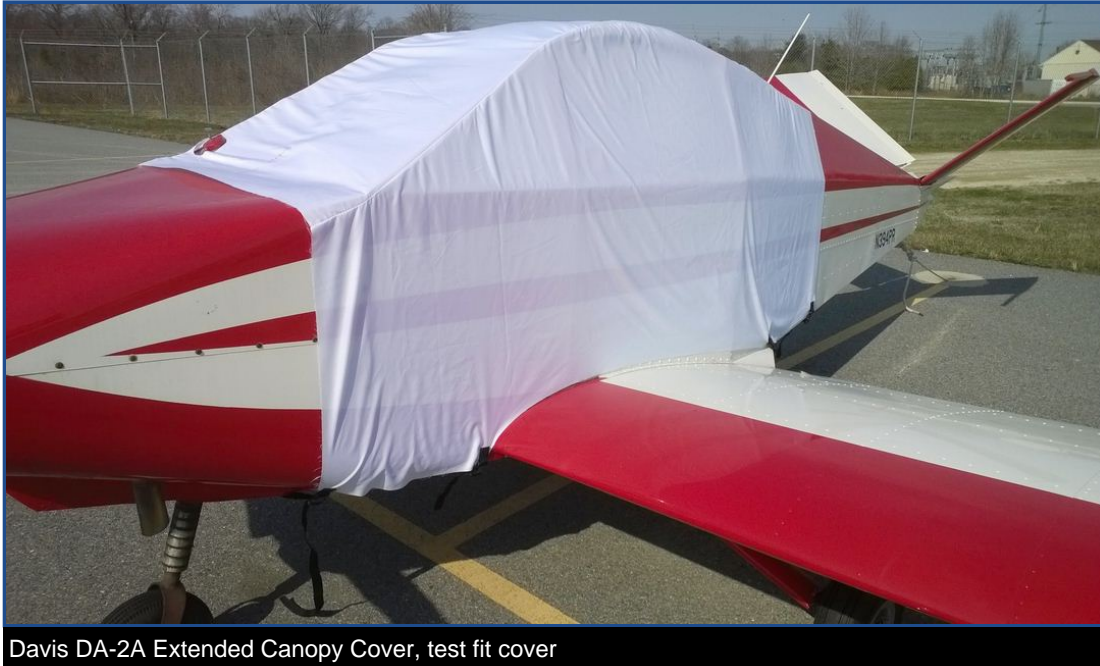
Davis DA-2A Extended Canopy Cover, test fit cover