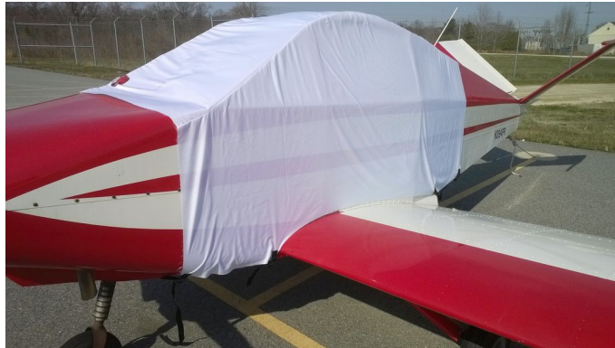
Davis DA-2A Extended Canopy Cover, test fit cover

This cover type is made from Silver Acrylic Sunbrella canvas and is 100% lined with a soft and smooth microfiber. Bruce's Custom Covers developed this material combination especially for aircraft protection. The outer material is medium weight and treated for water resistance, UV resistance and anti-static buildup. The inner lining is a very soft and smooth microfiber to prevent scratching. The material is very reflective, and tests show that the cabin interior temperature can be reduced to near-ambient temperature on the hottest of days. It is water, ice and snow repellent, yet breathable to allow moisture to escape from between the cover and the aircraft surface.