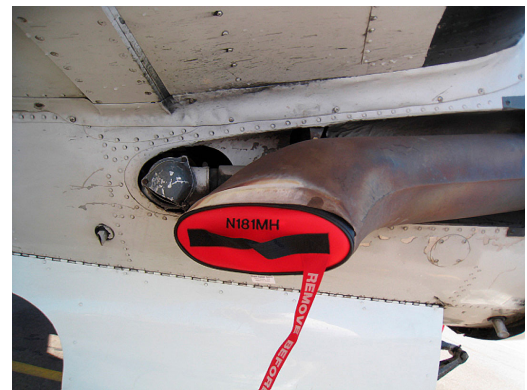
Beech 18 Exhaust Plugs