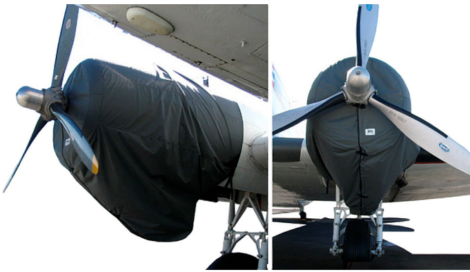
DC3 Engine Covers are custom made for various engine mod's.