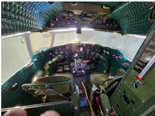
DC-3C Cockpit Heatshields

Cockpit Heatshields are interior sunshades for the aircraft's cockpit. The product is a unique composite of closed-cell foam with a silver mylar finish. The semi-rigid design is stiff enough to stand inside the window framing. The set folds up flat and is easily stored in the included storage sleeve. Some designs may require velcro and suction cups. A Heatshield is an excellent short-term remedy for cockpit overheating, but an external fabric cover is more effective for long-term protection.