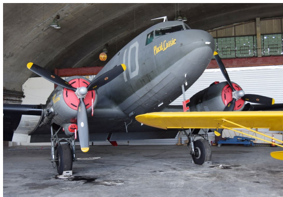
Douglas DC-3 Engine & Oil Cooler Plugs

Engine Inlet Plugs are custom fit for your Douglas DC-3 intakes, made with heavy-duty vinyl material, and stuffed with a single block of sculpted urethane foam. Each plug has a zipper that allows the foam to be removed and dried if necessary. Engine plugs have warning flags that are visible from the cockpit or 'remove before flight' streamers sewn onto the face of the plugs. Most plugs are imprinted with the aircraft registration number in black for an extra charge. Storage bag NOT included. Engine plugs may be inserted after flight when the engine is still warm. Engine Inlet Plugs are commonly referred to as Cowl Plugs, Intake Plugs, Cowl Blocks, Engine Blocks, and Engine Bungs.