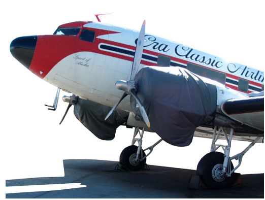
Engine Covers are available in either standard or insulated designs.