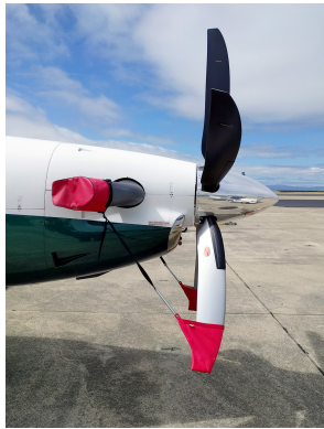
Pilatus PC-12 Prop Tie-Down/Exhaust Cover Set, 5 Blade

This cover type is made from Silver Acrylic Sunbrella canvas and is 100% lined with a soft and smooth microfiber. Bruce's Custom Covers developed this material combination especially for aircraft protection. The outer material is medium weight and treated for water resistance, UV resistance and anti-static buildup. The inner lining is a very soft and smooth microfiber to prevent scratching. The material is very reflective, and tests show that the cabin interior temperature can be reduced to near-ambient temperature on the hottest of days. It is water, ice and snow repellent, yet breathable to allow moisture to escape from between the cover and the aircraft surface.