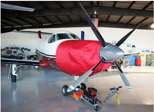
Pilatus PC-12 Insulated Engine Cover

This cover type is made from Silver Acrylic Sunbrella canvas and is 100% lined with a soft and smooth microfiber. Bruce's Custom Covers developed this material combination especially for aircraft protection. The outer material is medium weight and treated for water resistance, UV resistance and anti-static buildup. The inner lining is a very soft and smooth microfiber to prevent scratching. The material is very reflective, and tests show that the cabin interior temperature can be reduced to near-ambient temperature on the hottest of days. It is water, ice and snow repellent, yet breathable to allow moisture to escape from between the cover and the aircraft surface.