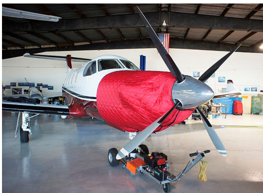
Pilatus PC-12 Insulated Engine Cover

This cover type is made from Silver Acrylic Sunbrella canvas and is 100% lined with a soft and smooth microfiber. Bruce's Custom Covers developed this material combination especially for aircraft protection. The outer material is medium weight and treated for water resistance, UV resistance and anti-static buildup. The inner lining is a very soft and smooth microfiber to prevent scratching. The material is very reflective, and tests show that the cabin interior temperature can be reduced to near-ambient temperature on the hottest of days. It is water, ice and snow repellent, yet breathable to allow moisture to escape from between the cover and the aircraft surface.