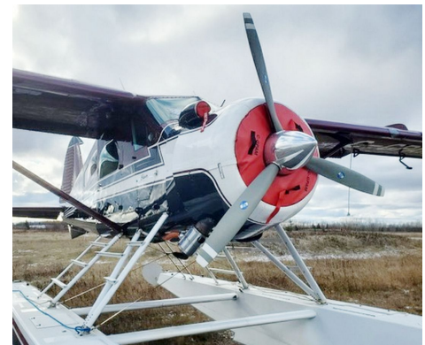
DeHavilland DH2 Beaver Engine Plugs