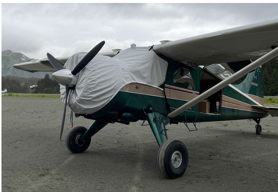
DeHavilland DH-2 Beaver Cockpit/Engine Cover

This cover type is made from Silver Acrylic Sunbrella canvas and is 100% lined with a soft and smooth microfiber. Bruce's Custom Covers developed this material combination especially for aircraft protection. The outer material is medium weight and treated for water resistance, UV resistance and anti-static buildup. The inner lining is a very soft and smooth microfiber to prevent scratching. The material is very reflective, and tests show that the cabin interior temperature can be reduced to near-ambient temperature on the hottest of days. It is water, ice and snow repellent, yet breathable to allow moisture to escape from between the cover and the aircraft surface.