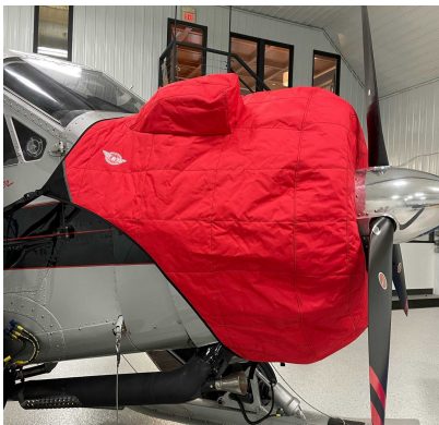
DeHavilland Beaver Insulated Engine Cover

This cover type is made from Silver Acrylic Sunbrella canvas and is 100% lined with a soft and smooth microfiber. Bruce's Custom Covers developed this material combination especially for aircraft protection. The outer material is medium weight and treated for water resistance, UV resistance and anti-static buildup. The inner lining is a very soft and smooth microfiber to prevent scratching. The material is very reflective, and tests show that the cabin interior temperature can be reduced to near-ambient temperature on the hottest of days. It is water, ice and snow repellent, yet breathable to allow moisture to escape from between the cover and the aircraft surface.