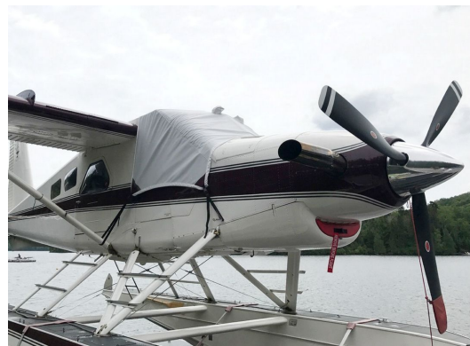
DeHavilland Turbo Beaver Cockpit Cover and Inlet Plug