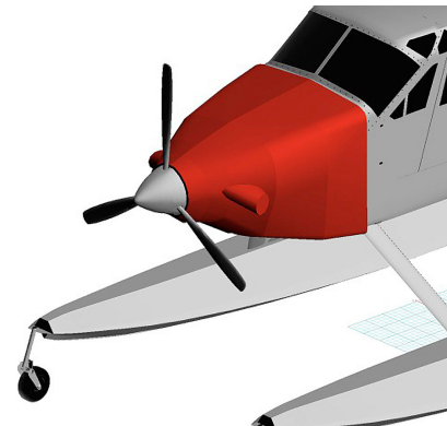
Turbo Beaver Insulated Engine Cover, 3D model