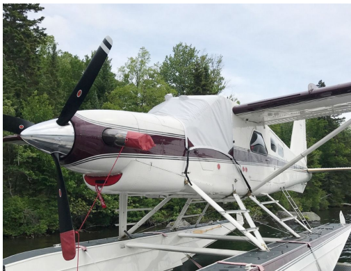
DeHavilland Turbo Beaver Cockpit Cover and Inlet Plug

Engine Inlet Plugs are custom fit for your DeHavilland Beaver DHC-2, U-6A, U-6B intakes, made with heavy-duty vinyl material, and stuffed with a single block of sculpted urethane foam. Each plug has a zipper that allows the foam to be removed and dried if necessary. Engine plugs have warning flags that are visible from the cockpit or 'remove before flight' streamers sewn onto the face of the plugs. Most plugs are imprinted with the aircraft registration number in black for an extra charge. Storage bag NOT included. Engine plugs may be inserted after flight when the engine is still warm. Engine Inlet Plugs are commonly referred to as Cowl Plugs, Intake Plugs, Cowl Blocks, Engine Blocks, and Engine Bungs.