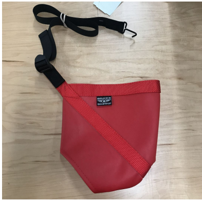
Prop Tie-Down, Various Models (secures with a hook to engine nacelle)