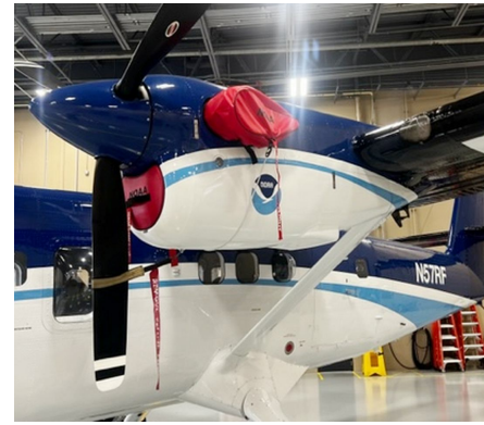
DeHavilland Twin Otter DHC6 Intake Plug, Exhaust Covers