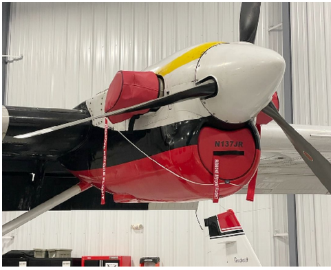
DeHavilland DH-6 Intake Plugs, Exhaust Covers