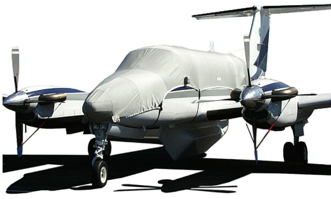
King Air Canopy/Nose Cover