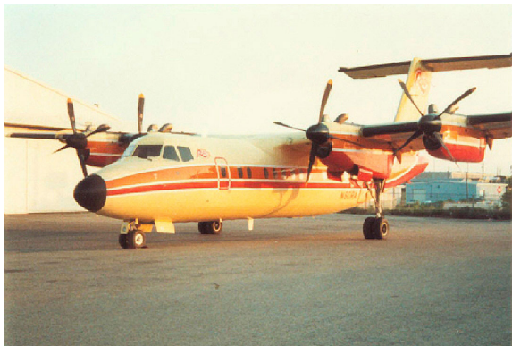
Covers & Plugs for the Dash 7

This cover type is made from Silver Acrylic Sunbrella canvas and is 100% lined with a soft and smooth microfiber. Bruce's Custom Covers developed this material combination especially for aircraft protection. The outer material is medium weight and treated for water resistance, UV resistance and anti-static buildup. The inner lining is a very soft and smooth microfiber to prevent scratching. The material is very reflective, and tests show that the cabin interior temperature can be reduced to near-ambient temperature on the hottest of days. It is water, ice and snow repellent, yet breathable to allow moisture to escape from between the cover and the aircraft surface.