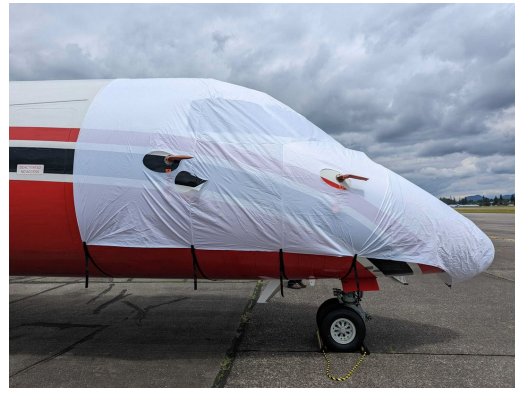
DeHavilland Dash 8, Q400 Cockpit/Nose Cover, test fit cover