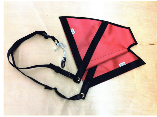
Aerospatiale ATR-42/72 Prop Tie-Downs