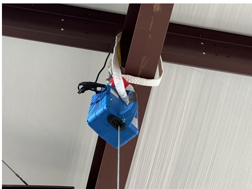
Stearman PT-13 Full Body Dust Cover, Remote Control Winch

Some high value aircraft end up logging lots of hangar time, and become dust magnets in the process. A high quality, well fitting dust cover provides easy assurance that the aircraft's surfaces remain clean and free of grit and grime. Available in a large variety of colors, each dust cover is custom made according to aircraft details and customer preferences. Fire retardant fabrics are also available.