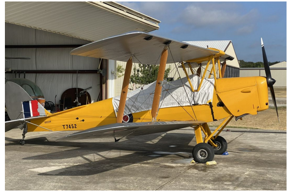
Dehavilland DH-82 Tiger Moth Canopy Cover