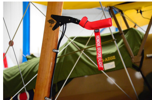
DeHavilland DH-82 Tiger Moth Pitot Cover