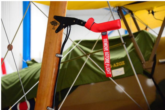
DeHavilland DH-82 Tiger Moth Pitot Cover

DeHavilland DH-82 Tiger Moth Pitot Tube Covers , NOT HEAT RESISTANT TYPE, are made of Naugahyde vinyl, and are designed to cover the entire pitot assembly. Slipping over the tube, the cover tightens around the base with a Velcro strap detail. A "Remove Before Flight" streamer is attached to the cover. Heat Resistant Pitot Covers are an upgrade to this design, and help prevent the pitot cover from melting onto the tube if the pitot heat is accidentally turned on while installed. If you want the set tethered together, please let us know.