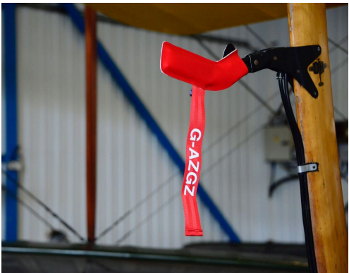
DeHavilland DH-82 Tiger Moth Pitot Cover