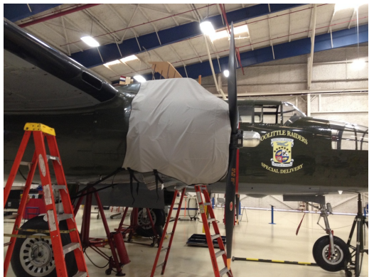
B25 Engine Cover

Engine Covers will cinch around or behind the spinner, cover the entire engine cowl area including the engine air cooling and induction air inlets, and fastens together with Velcro beneath the spinner down the front of the cowling. The Engine Cover is attached with a belly strap aft of the firewall, and can Velcro to the Canopy Cover. Engine Covers are normally made from Solution-Dyed Polyester or Acrylic Sunbrella . An Insulated version of the engine cover can be made with a thicker, quilted, and water-repellent material. The Insulated Engine Cover works well in cold climates to help with engine preheating.