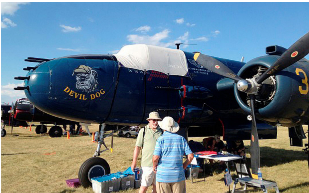
Mitchell B25 Cockpit Cover w/ Custom Imprint (Bellystrap Type) Mitchell B25 Cockpit Cover w/ Custom Imprint (Bellystrap Type)