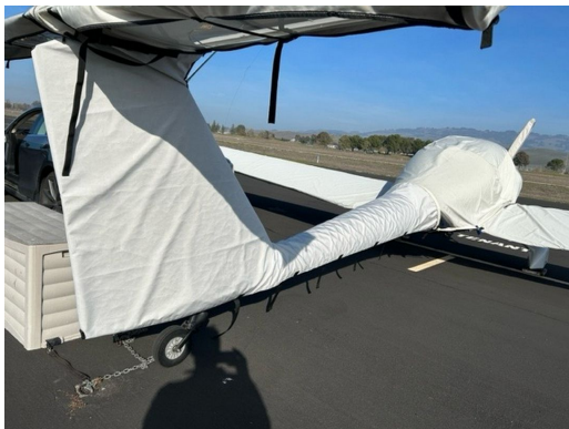
Dimona HK-36 Empennage Cover Set

WINTER USE MATERIAL - Made with Solution-Dyed Polyester fabric, this option is intended for seasonal use to aid in deicing, rain mitigation, or for occasional travel. The material is lighter and more compact, but more susceptible to UV damage and may have a shorter useful life if used continuously outside than the all-year use material.