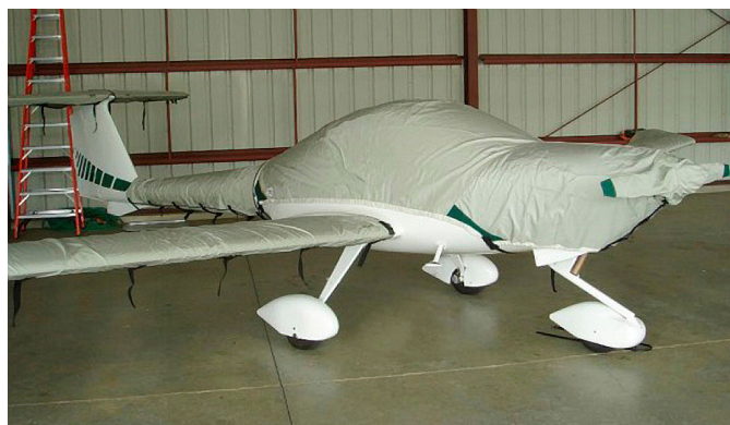
DA-20 Canopy/Engine, Prop/Spinner, Wing, Tailboom, Horiz. Stab. Covers