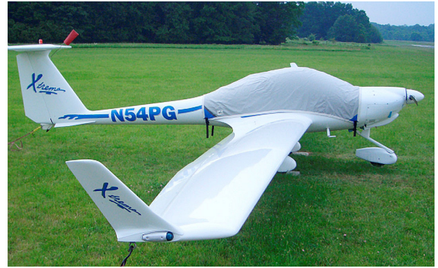
Dimona Xtreme Canopy Cover