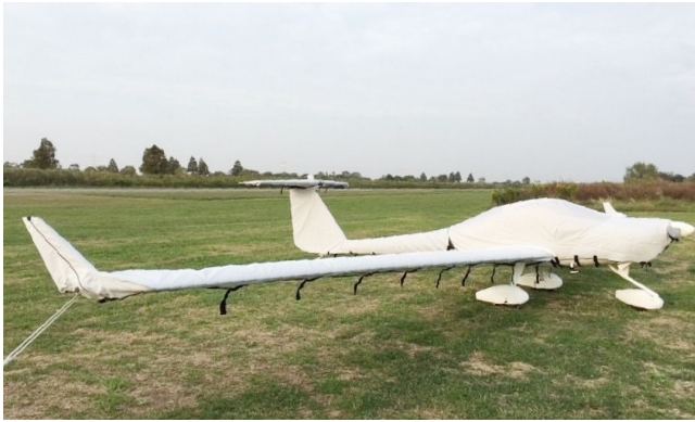
Diamond Super Dimona Cover Set

The Diamond HK-36, Super Dimona & Extreme Canopy/Engine Cover is a one-piece cover (100% lined with microfiber) that is a combination of the Canopy Cover and Engine Cover. This cover will enclose the engine cowl and will extend aft to cover all of the windows. This cover type is made from Silver Acrylic Sunbrella canvas and is 100% lined with a soft and smooth microfiber. Bruce's Custom Covers developed this material combination especially for aircraft protection. The outer material is medium weight and treated for water resistance, UV resistance and anti-static buildup. The inner lining is a very soft and smooth microfiber to prevent scratching. The material is very reflective, and tests show that the cabin interior temperature can be reduced to near-ambient temperature on the hottest of days. It is water, ice and snow repellent, yet breathable to allow moisture to escape from between the cover and the aircraft surface.