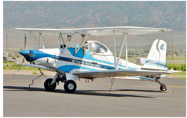
Covers for the Eagle DW-1