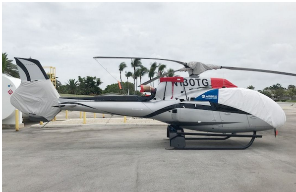
AIRBUS H130 T2, Intake, Exhaust & Tailfan Covers

The Tailboom Cover details vary by model, but generally the helicopter tail boom cover encloses the tail boom from the "bottleneck" to the aft end. They usually also cover the horizontal stabilizers, and are custom made to allow for antennae, lights, and other protrusions. They attach with straps underneath the tail boom. Covers for the vertical and horizontal stabilizers are also available separately. Specific information for each model is available on request.