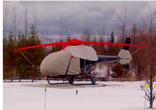
EC-130 Bubble, Engine, Rotor Hub, Blade & Tailfin Covers