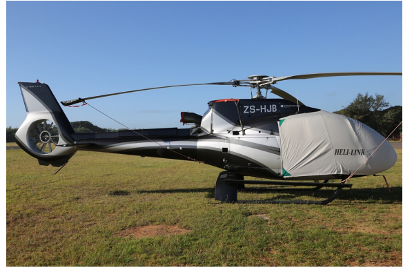
EC-130 Bubble Cover