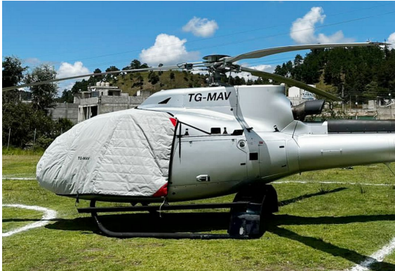
Airbus H-130 Insulated Bubble Cover

This cover type is made from Silver Acrylic Sunbrella canvas and is 100% lined with a soft and smooth microfiber. Bruce's Custom Covers developed this material combination especially for aircraft protection. The outer material is medium weight and treated for water resistance, UV resistance and anti-static buildup. The inner lining is a very soft and smooth microfiber to prevent scratching. The material is very reflective, and tests show that the cabin interior temperature can be reduced to near-ambient temperature on the hottest of days. It is water, ice and snow repellent, yet breathable to allow moisture to escape from between the cover and the aircraft surface.