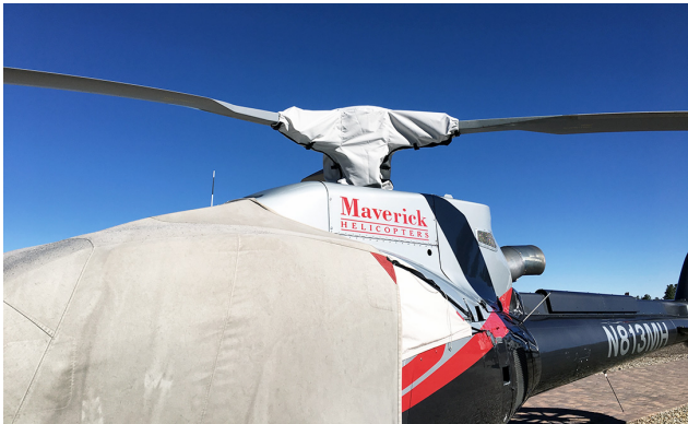
Eurocopter EC-130 Main Rotor Hub Cover

circulation and drainage in freezing weather. Some part numbers have features for an extra charge.