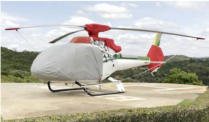
EC130 Bubble, Intake, Exhaust, Rotor Hub & Tailfan Covers

This cover type is made from Silver Acrylic Sunbrella canvas and is 100% lined with a soft and smooth microfiber. Bruce's Custom Covers developed this material combination especially for aircraft protection. The outer material is medium weight and treated for water resistance, UV resistance and anti-static buildup. The inner lining is a very soft and smooth microfiber to prevent scratching. The material is very reflective, and tests show that the cabin interior temperature can be reduced to near-ambient temperature on the hottest of days. It is water, ice and snow repellent, yet breathable to allow moisture to escape from between the cover and the aircraft surface.