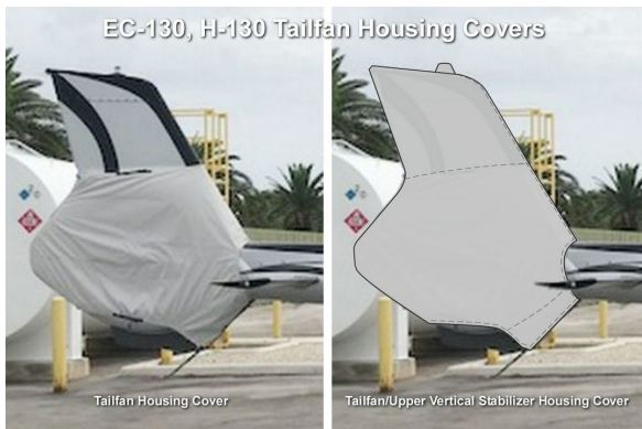
Airbus Helicopter H-130 Tailfan Housing Covers

The Tailboom Cover details vary by model, but generally the helicopter tail boom cover encloses the tail boom from the "bottleneck" to the aft end. They usually also cover the horizontal stabilizers, and are custom made to allow for antennae, lights, and other protrusions. They attach with straps underneath the tail boom. Covers for the vertical and horizontal stabilizers are also available separately. Specific information for each model is available on request.