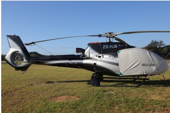
EC-130 Bubble Cover

This cover type is made from Silver Acrylic Sunbrella canvas and is 100% lined with a soft and smooth microfiber. Bruce's Custom Covers developed this material combination especially for aircraft protection. The outer material is medium weight and treated for water resistance, UV resistance and anti-static buildup. The inner lining is a very soft and smooth microfiber to prevent scratching. The material is very reflective, and tests show that the cabin interior temperature can be reduced to near-ambient temperature on the hottest of days. It is water, ice and snow repellent, yet breathable to allow moisture to escape from between the cover and the aircraft surface.