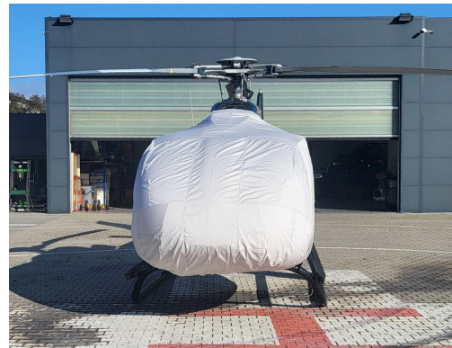
Airbus Helicopter H-130 Bubble Cover, Extends To Cover Fwd Engine Inlet