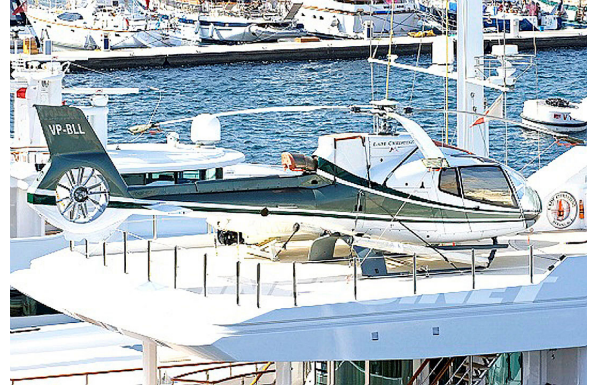
EC-130 Front, Side and Skylight Window HeatShields