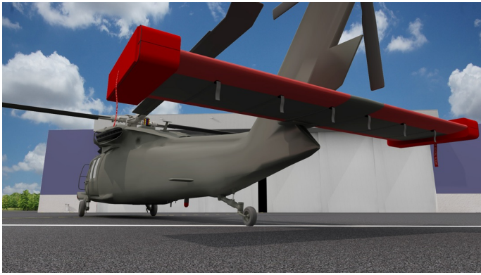
Padded Horizontal Stab Covers, Wingtip Pads (illustration)