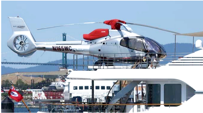
Intake/Exhaust Cover & Rotor Hub Cover (w/ skirt)

tight at the blade root with straps and quick-release plastic buckles. The Cold Weather Blade Covers are fitted with full-length zippers and optional deice “boots” designed to accept a preheater hose; a small opening at the tip of the cover allows for some air circulation and drainage in freezing weather. Some part numbers have features for an extra charge.