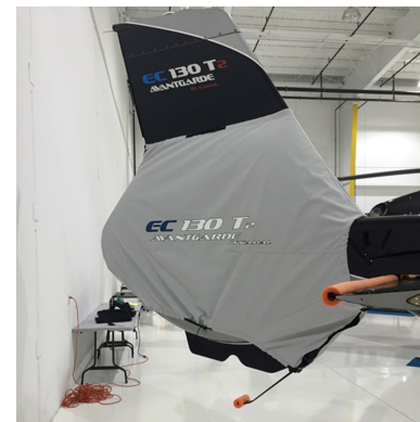
EC-130 Tailfan Cover