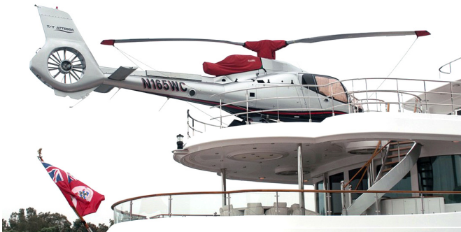
Intake/Exhaust Cover, Rotor Hub Cover (w/ skirt) & Blade Tie Downs