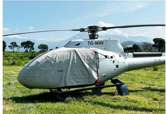
Airbus H-130 Insulated Bubble Cover