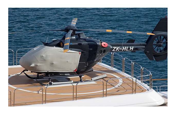
EC-135 Bubble Cover & Exhaust Plugs