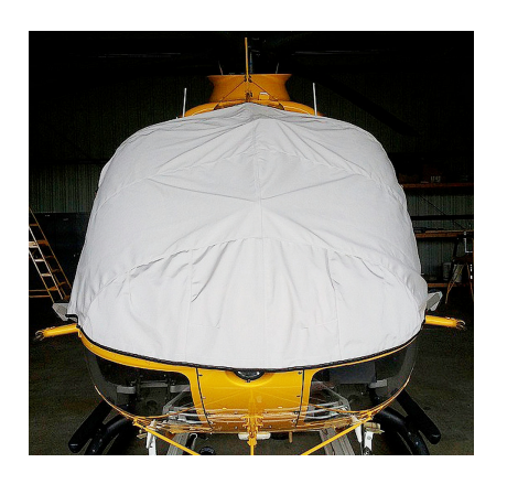
EC-135 Windshield/Skylights Cover, pinches in door jambs