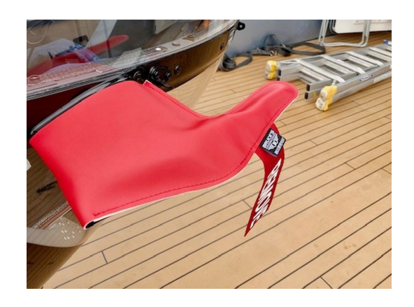
Airbus Helicopter H145 Pitot Tube Cover