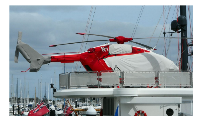
Eurocopter EC-135 Bubble, Engine, Rotor Hub, Tail Surfaces Covers