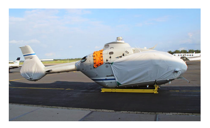
Bubble Cover and Tailfan Cover