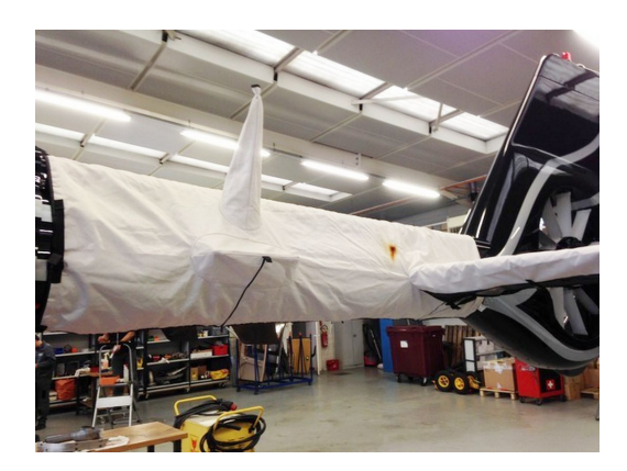
Airbus EC-135 Tailboom/Stabilizer Cover

The Tailboom Cover details vary by model, but generally the helicopter tail boom cover encloses the tail boom from the "bottleneck" to the aft end. They usually also cover the horizontal stabilizers, and are custom made to allow for antennae, lights, and other protrusions. They attach with straps underneath the tail boom. Covers for the vertical and horizontal stabilizers are also available separately. Specific information for each model is available on request.