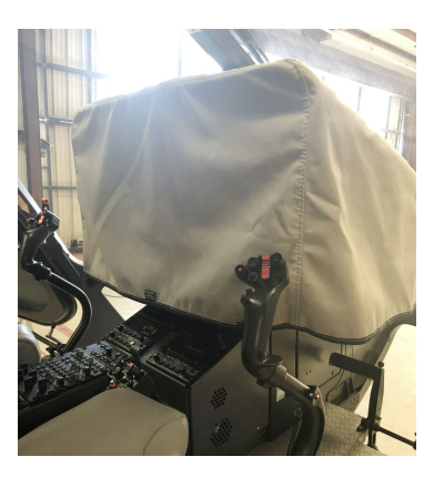
Eurocopter EC-135 Instrument Panel Heatshield Cover