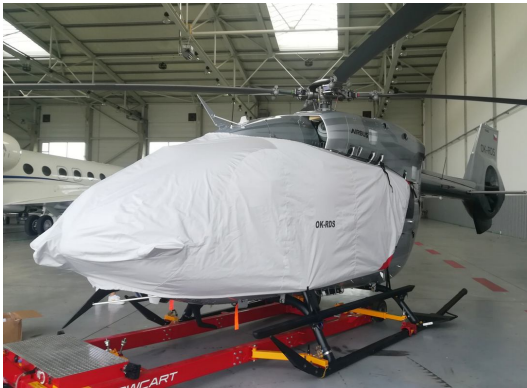
Airbus Helicopter EC-145 Bubble Cover with Radome & Wire Strike

This cover type is made from Silver Acrylic Sunbrella canvas and is 100% lined with a soft and smooth microfiber. Bruce's Custom Covers developed this material combination especially for aircraft protection. The outer material is medium weight and treated for water resistance, UV resistance and anti-static buildup. The inner lining is a very soft and smooth microfiber to prevent scratching. The material is very reflective, and tests show that the cabin interior temperature can be reduced to near-ambient temperature on the hottest of days. It is water, ice and snow repellent, yet breathable to allow moisture to escape from between the cover and the aircraft surface.