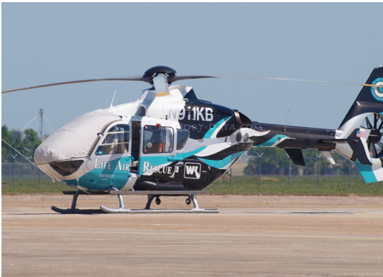
Eurocopter EC-135 Windshield/Skylight Cover