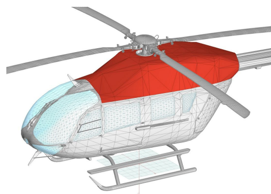
Intake/Exhaust Engine Area Cover, 3D Rendering