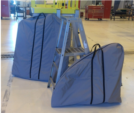
Eurocopter EC-145 Padded Bags for Removable Doors

**Padded Door Bags* are designed to provide portable protection of the doors when they are removed from the aircraft. They are padded to moderate thickness, zippered closed, and have sturdy carry handles for easy transport.