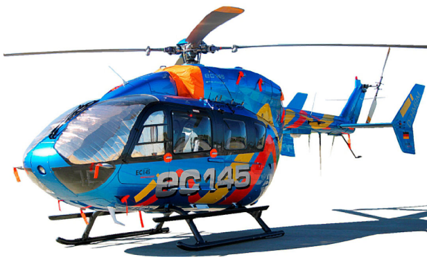
EC-145 Cabin Heatshield Set

Heatshields are interior sunshades for an aircraft's windows or canopy glass. The product is a unique composite of closed-cell foam with a silver mylar finish. The semi-rigid design is stiff enough to stand along the inside of the windshield using sun visors or window framing. It folds up flat and easily stores in the included storage sleeve. Some designs may require velcro and suction cups. A Heatshield is an excellent short-term remedy for cockpit overheating.