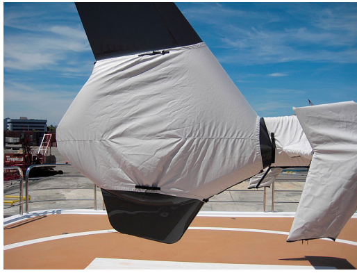
EC-135 Tailfan Cover and Tailboom Stabilizer Cover