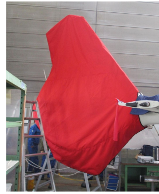
Airbus EC145 Tailfan Housing Fenestron Cover