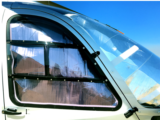
Eurocopter EC-145 Cockpit Heatshields

Heatshields are interior sunshades for an aircraft's windows or canopy glass. The product is a unique composite of closed-cell foam with a silver mylar finish. The semi-rigid design is stiff enough to stand along the inside of the windshield using sun visors or window framing. It folds up flat and easily stores in the included storage sleeve. Some designs may require velcro and suction cups. A Heatshield is an excellent short-term remedy for cockpit overheating.