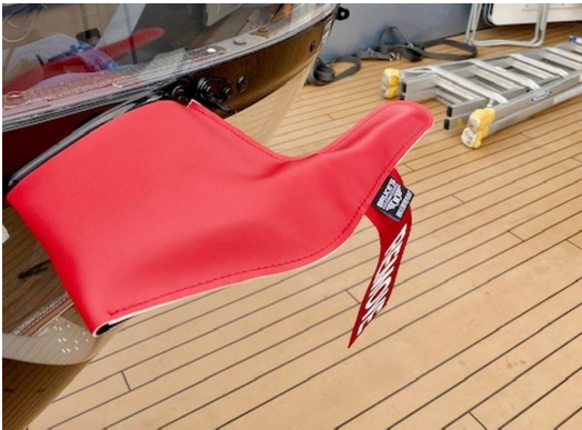
Airbus Helicopter H145 Pitot Tube Cover

The Engine Inlet Plugs are custom fit for your Eurocopter EC-145, UH-145, BK-117 D-2 intakes, made with heavy-duty vinyl material, and stuffed with a single block of sculpted urethane foam. Each plug has a zipper that allows the foam to be removed and dried if necessary. Engine plugs have 'Remove Before Flight' streamers sewn onto the face of the plugs. Most plugs are imprinted with the aircraft registration number in black for an extra charge. Storage bag NOT included. Engine plugs may be inserted after flight when the engine is still warm. Engine Inlet Plugs are commonly referred to as Cowl Plugs, Intake Plugs, Cowl Blocks, Engine Blocks, and Engine Bungs.