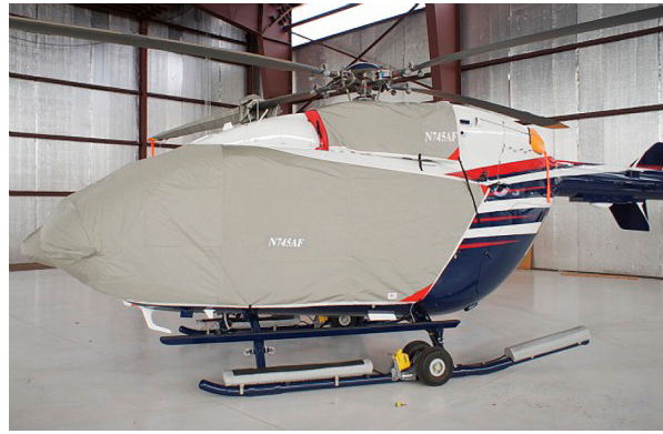
Bubble Cover w/ nose mounted radome, Upper Deck Plugs/Cover