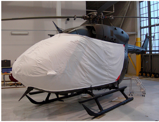
EC-145 Bubble Cover