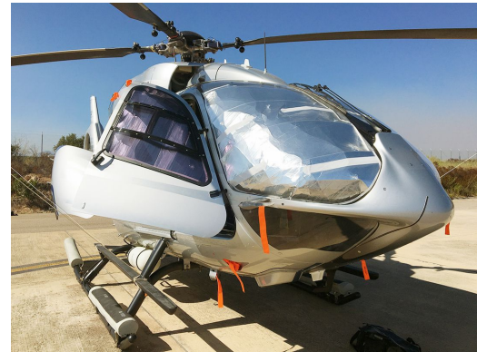
Eurocopter EC-145 Cockpit Heatshields