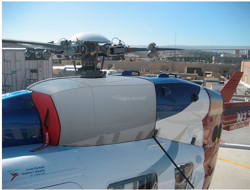
Upper Deck Plugs/Cover

The Engine Inlet Plugs are custom fit for your Eurocopter EC-145, UH-145, BK-117 D-2 intakes, made with heavy-duty vinyl material, and stuffed with a single block of sculpted urethane foam. Each plug has a zipper that allows the foam to be removed and dried if necessary. Engine plugs have 'Remove Before Flight' streamers sewn onto the face of the plugs. Most plugs are imprinted with the aircraft registration number in black for an extra charge. Storage bag NOT included. Engine plugs may be inserted after flight when the engine is still warm. Engine Inlet Plugs are commonly referred to as Cowl Plugs, Intake Plugs, Cowl Blocks, Engine Blocks, and Engine Bungs.