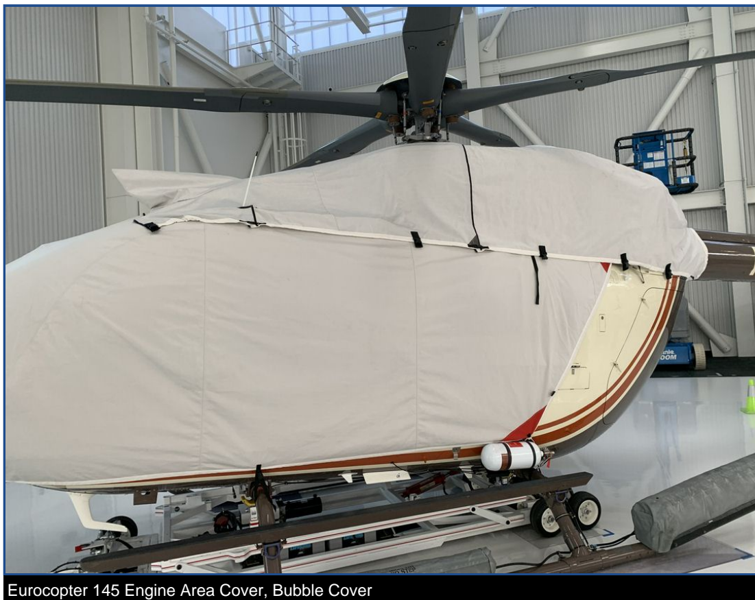
Eurocopter 145 Engine Area Cover, Bubble Cover