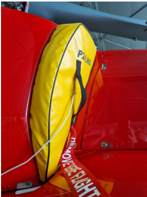
Airbus Helicopter H145D3 Intake Plugs