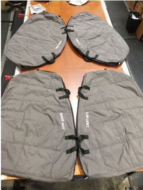
MD 500D Padded Door Bags