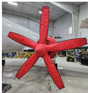
Fairchild Metro 5 Blade Insulated Insulated Prop Covers