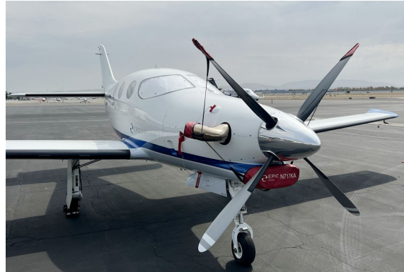
Epic Aircraft Prop Tie, Exhaust & Intake Covers