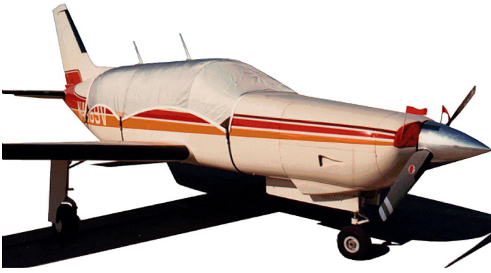
Malibu/Mirage/Meridian Standard Canopy Cover