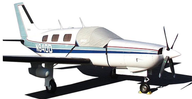
Piper Malibu/Mirage Windshield Cover