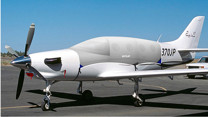
Epic LT Canopy Cover & Engine Plugs

Engine Inlet Plugs are custom fit for your Epic E1000 intakes, made with heavy-duty vinyl material, and stuffed with a single block of sculpted urethane foam. Each plug has a zipper that allows the foam to be removed and dried if necessary. Engine plugs have warning flags that are visible from the cockpit or 'remove before flight' streamers sewn onto the face of the plugs. Most plugs are imprinted with the aircraft registration number in black for an extra charge. Storage bag NOT included. Engine plugs may be inserted after flight when the engine is still warm. Engine Inlet Plugs are commonly referred to as Cowl Plugs, Intake Plugs, Cowl Blocks, Engine Blocks, and Engine Bungs.