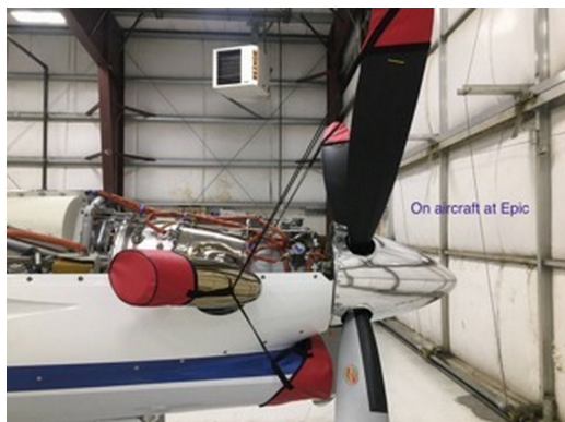
Epic Aircraft Prop Tie, Exhaust & Intake Covers

This cover type is made from Silver Acrylic Sunbrella canvas and is 100% lined with a soft and smooth microfiber. Bruce's Custom Covers developed this material combination especially for aircraft protection. The outer material is medium weight and treated for water resistance, UV resistance and anti-static buildup. The inner lining is a very soft and smooth microfiber to prevent scratching. The material is very reflective, and tests show that the cabin interior temperature can be reduced to near-ambient temperature on the hottest of days. It is water, ice and snow repellent, yet breathable to allow moisture to escape from between the cover and the aircraft surface.