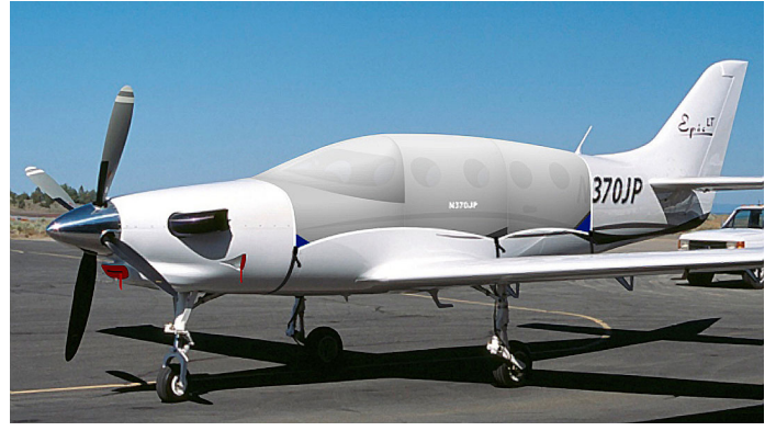
Epic LT Canopy Cover & Engine Plugs