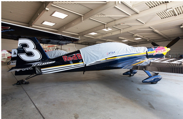
Extra 300L Canopy Cover

This cover type is made from Silver Acrylic Sunbrella canvas and is 100% lined with a soft and smooth microfiber. Bruce's Custom Covers developed this material combination especially for aircraft protection. The outer material is medium weight and treated for water resistance, UV resistance and anti-static buildup. The inner lining is a very soft and smooth microfiber to prevent scratching. The material is very reflective, and tests show that the cabin interior temperature can be reduced to near-ambient temperature on the hottest of days. It is water, ice and snow repellent, yet breathable to allow moisture to escape from between the cover and the aircraft surface.