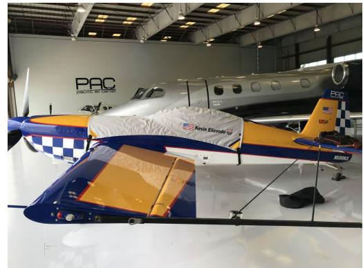
Extra 300S Canopy Cover