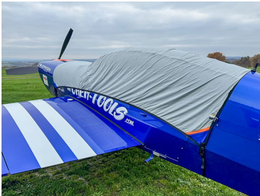
EXTRA 330LT Travel Cover, Light Weight Canopy Cover (2 seat model, Low Wing Models)

Travel Covers are made with Silver Solution-Dyed Polyester fabric and only lined over the windshield to save weight. The material is lightweight and more compact for easy stowage in the aircraft. The polyester material is water resistant, but only intended for occasional use outside. We also have an ultra lightweight material available for fitted hangar dust covers. For daily outdoor use, the non-travel Sunbrella Cover is the best choice.