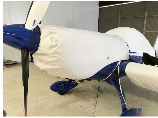
Extra 300, 330SC & 200/230 Models Engine Cover