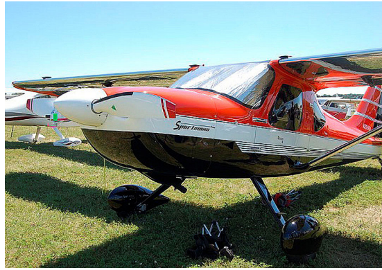
Glastar Sportsman Windshield HeatShield

or split right and left sides. A Heatshield is an excellent short-term remedy for cockpit overheating. An external fabric cover is far more effective and practical for long-term protection.