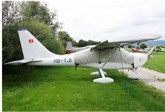
Glstar Canopy, Wings, Horizontal Stab. & Prop Covers

WINTER USE MATERIAL - Made with Solution-Dyed Polyester fabric, this option is intended for seasonal use to aid in deicing, rain mitigation, or for occasional travel. The material is lighter and more compact, but more susceptible to UV damage and may have a shorter useful life if used continuously outside than the all-year use material.