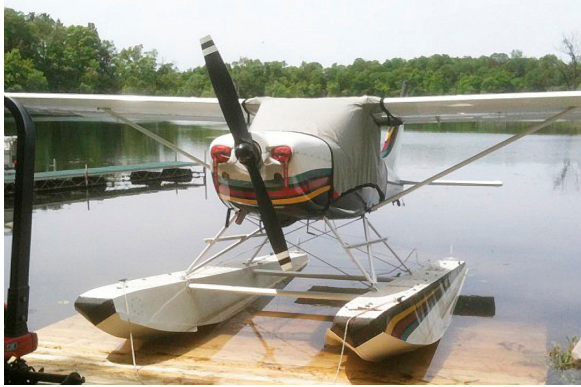
Glstar Sportsman Canopy Cover and Engine Plugs

plugs have warning flags that are visible from the cockpit or 'remove before flight' streamers sewn onto the face of the plugs. Most plugs are imprinted with the aircraft registration number in black for an extra charge. Storage bag NOT included. Engine plugs may be inserted after flight when the engine is still warm. Engine Inlet Plugs are commonly referred to as Cowl Plugs, Intake Plugs, Cowl Blocks, Engine Blocks, and Engine Bungs.