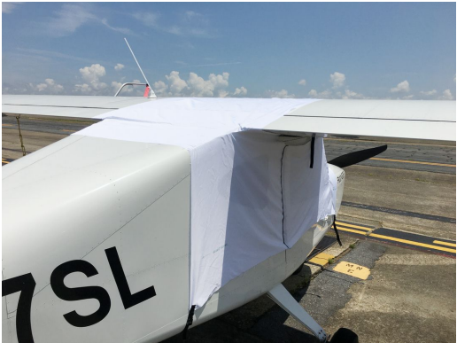
Vashon Ranger VR-7 Canopy Cover, test fit cover