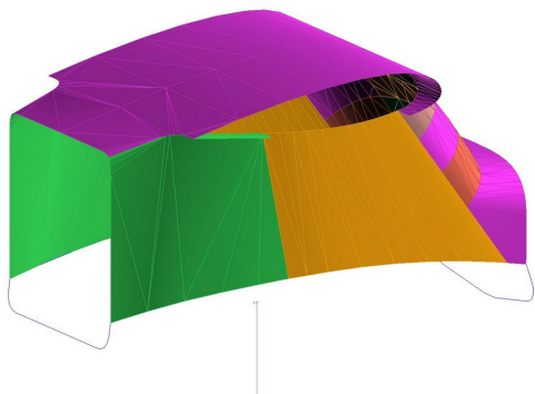
Vashon R-7 Ranger Canopy Cover, 3D model

This cover type is made from Silver Acrylic Sunbrella canvas and is 100% lined with a soft and smooth microfiber. Bruce's Custom Covers developed this material combination especially for aircraft protection. The outer material is medium weight and treated for water resistance, UV resistance and anti-static buildup. The inner lining is a very soft and smooth microfiber to prevent scratching. The material is very reflective, and tests show that the cabin interior temperature can be reduced to near-ambient temperature on the hottest of days. It is water, ice and snow repellent, yet breathable to allow moisture to escape from between the cover and the aircraft surface.