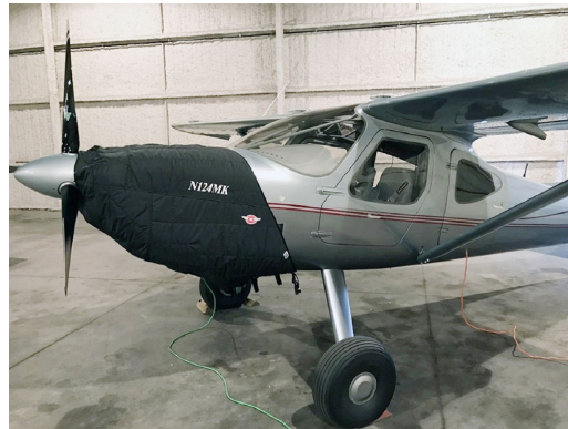
Glasair Aviation Glastar, Sportsman 2+2 Insulated Engine Cover