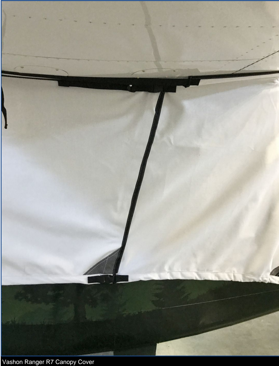
Vashon Ranger R7 Canopy Cover