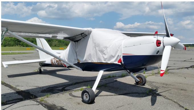
Glastar Over-Top Canopy Cover, Engine Plugs

Travel Covers are made with Silver Solution-Dyed Polyester fabric and only lined over the windshield to save weight. The material is lightweight and more compact for easy stowage in the aircraft. The polyester material is water resistant, but only intended for occasional use outside. We also have an ultra lightweight material available for fitted hangar dust covers. For daily outdoor use, the non-travel Sunbrella Cover is the best choice.