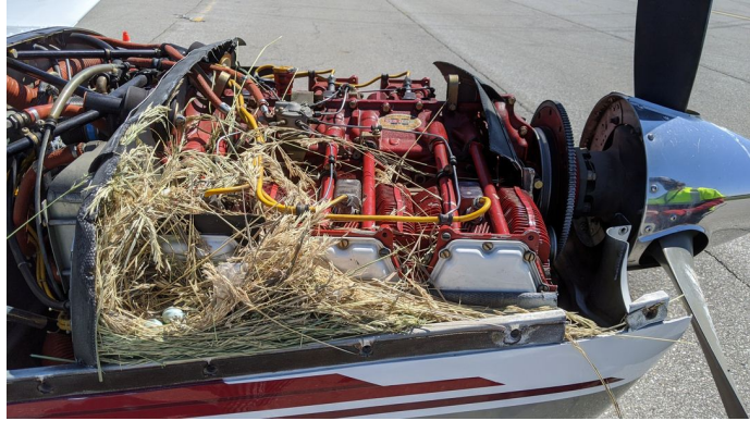
ENGINE PLUGS PREVENT BIRD NEST FOD. Piper Saratoga Engine Cowling Bird's Nest