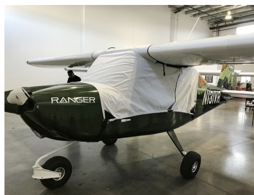
Vashon Ranger R7 Canopy Cover