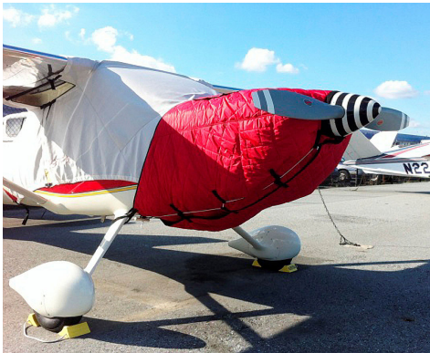
Glastar Insulated Engine Cover

This cover type is made from Silver Acrylic Sunbrella canvas and is 100% lined with a soft and smooth microfiber. Bruce's Custom Covers developed this material combination especially for aircraft protection. The outer material is medium weight and treated for water resistance, UV resistance and anti-static buildup. The inner lining is a very soft and smooth microfiber to prevent scratching. The material is very reflective, and tests show that the cabin interior temperature can be reduced to near-ambient temperature on the hottest of days. It is water, ice and snow repellent, yet breathable to allow moisture to escape from between the cover and the aircraft surface.