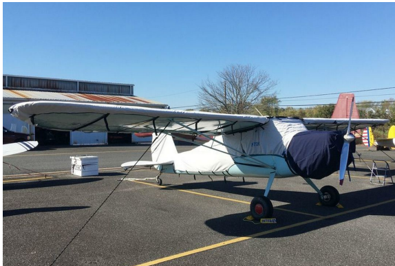
Cessna 140 Insulated Engine, Canopy, Empennage & Wing Covers

WINTER USE MATERIAL - Made with Solution-Dyed Polyester fabric, this option is intended for seasonal use to aid in deicing, rain mitigation, or for occasional travel. The material is lighter and more compact, but more susceptible to UV damage and may have a shorter useful life if used continuously outside than the all-year use material.