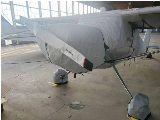
Cessna 140 Canopy, Wings, Prop, Tires & Empennage Covers