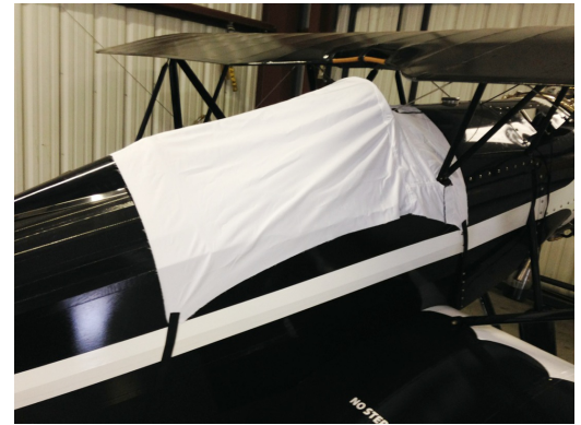
Rose Parakeet Canopy Cover (test fit cover)