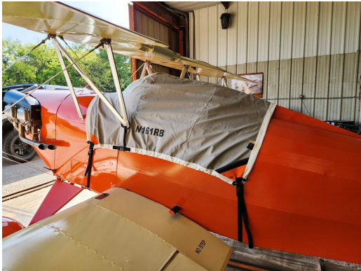
Burt Special Canopy Cover

This cover type is made from Silver Acrylic Sunbrella canvas and is 100% lined with a soft and smooth microfiber. Bruce's Custom Covers developed this material combination especially for aircraft protection. The outer material is medium weight and treated for water resistance, UV resistance and anti-static buildup. The inner lining is a very soft and smooth microfiber to prevent scratching. The material is very reflective, and tests show that the cabin interior temperature can be reduced to near-ambient temperature on the hottest of days. It is water, ice and snow repellent, yet breathable to allow moisture to escape from between the cover and the aircraft surface.