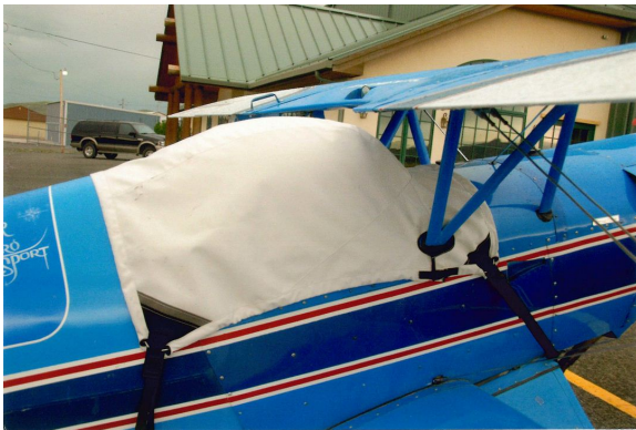
Acro Sport Canopy Cover