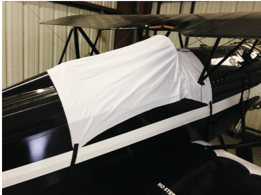
Rose Parrakeet Canopy Cover (test fit cover)