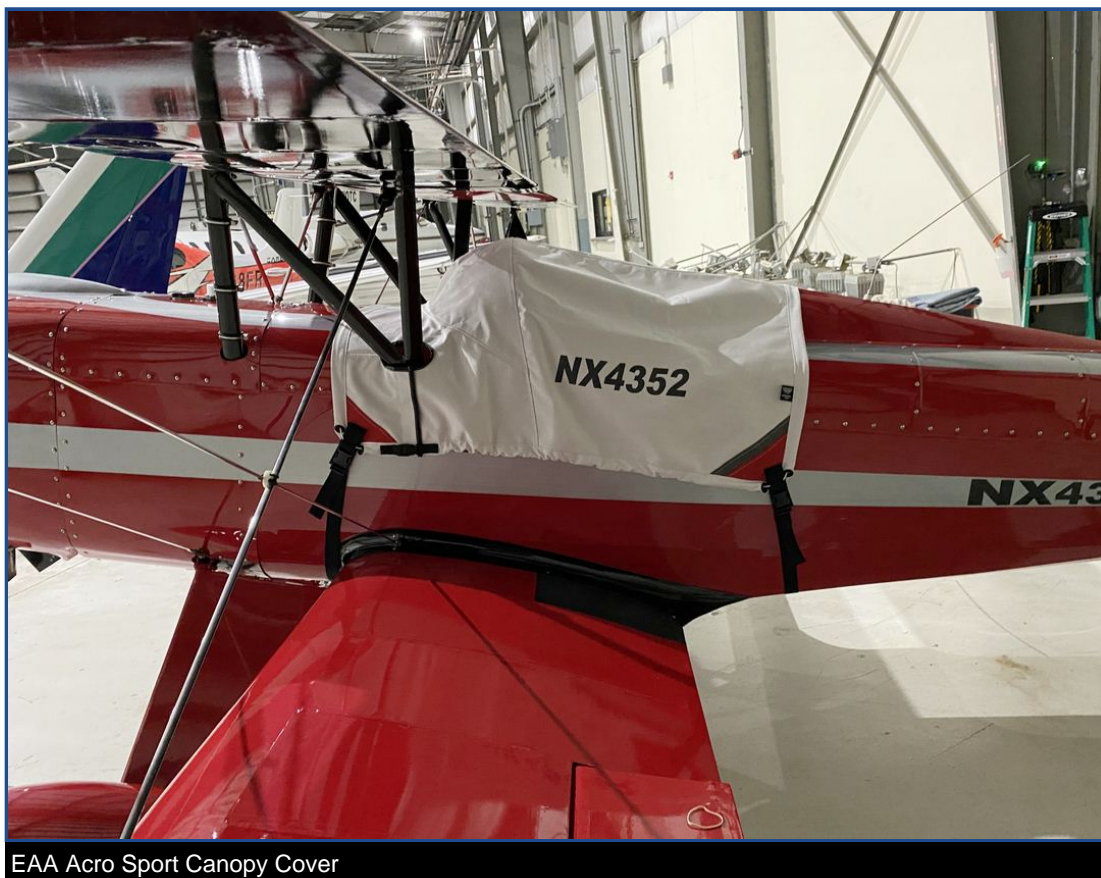
EAA Acro Sport Canopy Cover