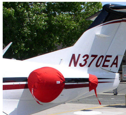
Eclipse Engine Covers, Bruce's design

The Eclipse EA500, TE500, 550 Bikini Style Engine Covers are a single-piece design using a soft and smooth stretchy fabric. The cover stretches tightly over both the intake and exhaust, installing quickly and easily. These covers are designed to be used as hangar dust covers and have a useful life of approximately one year.