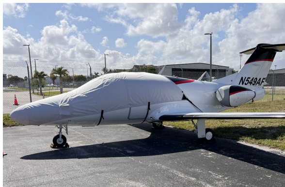
Eclipse EA500 Canopy/Nose Cover