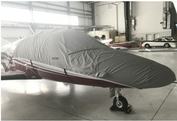
Eclipse EA550 Travel Canopy/Nose Cover

This cover type is made from Silver Acrylic Sunbrella canvas and is 100% lined with a soft and smooth microfiber. Bruce's Custom Covers developed this material combination especially for aircraft protection. The outer material is medium weight and treated for water resistance, UV resistance and anti-static buildup. The inner lining is a very soft and smooth microfiber to prevent scratching. The material is very reflective, and tests show that the cabin interior temperature can be reduced to near-ambient temperature on the hottest of days. It is water, ice and snow repellent, yet breathable to allow moisture to escape from between the cover and the aircraft surface.