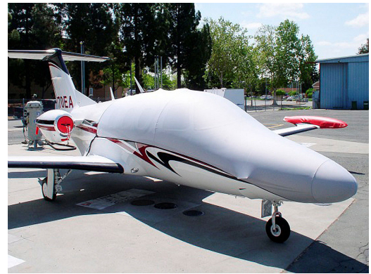
Eclipse Light Weight Travel Cover & Engine Plugs