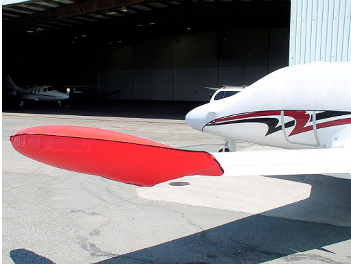
Eclipse Tip Tank Cover

Designed to prevent damage to the aircraft extremities in crowded hangars, these products are made of bright red Naugahyde and thickly padded with a sandwich of closed cell foam. Nowadays they are also made using bright red Neoprene padded laminated (think: wetsuit material).