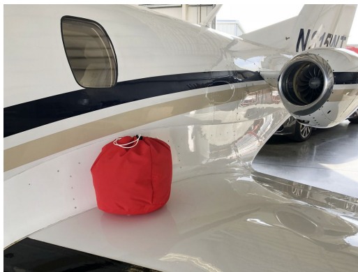
Eclipse EA500, TE500, 550 Travel Cover, Canopy/Nose Cover in Storage bag

This cover type is made from Silver Acrylic Sunbrella canvas and is 100% lined with a soft and smooth microfiber. Bruce's Custom Covers developed this material combination especially for aircraft protection. The outer material is medium weight and treated for water resistance, UV resistance and anti-static buildup. The inner lining is a very soft and smooth microfiber to prevent scratching. The material is very reflective, and tests show that the cabin interior temperature can be reduced to near-ambient temperature on the hottest of days. It is water, ice and snow repellent, yet breathable to allow moisture to escape from between the cover and the aircraft surface.