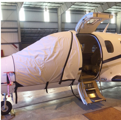
Eclipse Cockpit Door Cover, with Pitot Tube Covers

This cover type is made from Silver Acrylic Sunbrella canvas and is 100% lined with a soft and smooth microfiber. Bruce's Custom Covers developed this material combination especially for aircraft protection. The outer material is medium weight and treated for water resistance, UV resistance and anti-static buildup. The inner lining is a very soft and smooth microfiber to prevent scratching. The material is very reflective, and tests show that the cabin interior temperature can be reduced to near-ambient temperature on the hottest of days. It is water, ice and snow repellent, yet breathable to allow moisture to escape from between the cover and the aircraft surface.