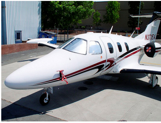
Eclipse Pitot Cover & Bikini Type Engine Covers