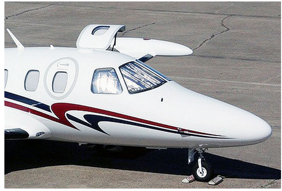
Eclipse Cockpit Heatshields