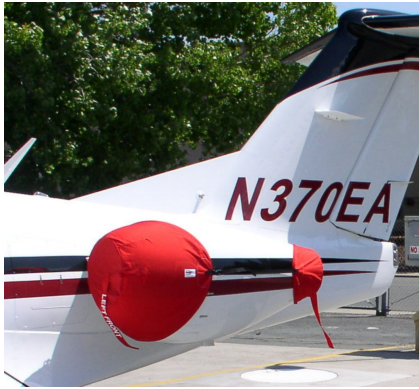
Eclipse Engine Covers, standard design

The Eclipse EA500, TE500, 550 Bikini Style Engine Covers are a single-piece design using a soft and smooth stretchy fabric. The cover stretches tightly over both the intake and exhaust, installing quickly and easily. These covers are designed to be used as hangar dust covers and have a useful life of approximately one year.