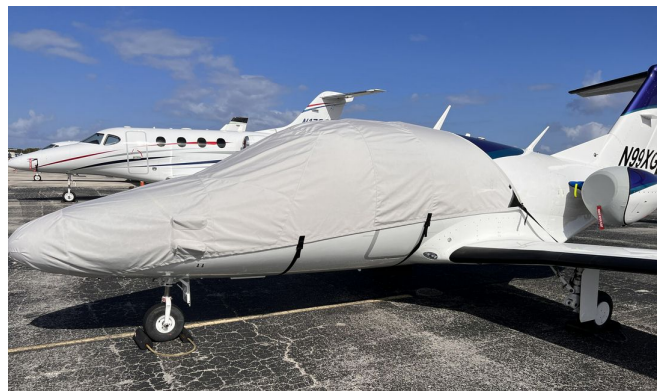
Eclipse EA500 Canopy/Nose Cover