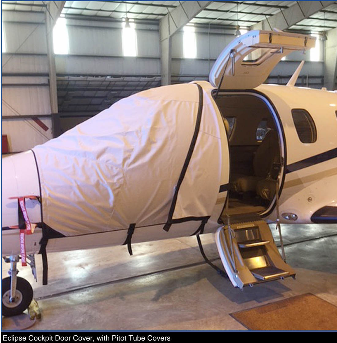
Eclipse Cockpit Door Cover, with Pitot Tube Covers