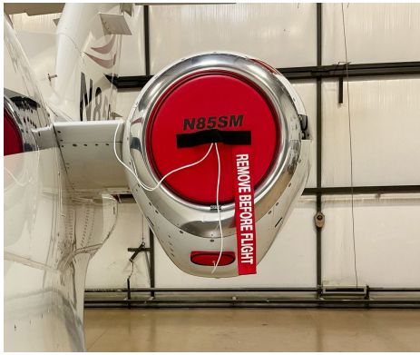
Eclipse EA500 Intake/Exhaust Plugs