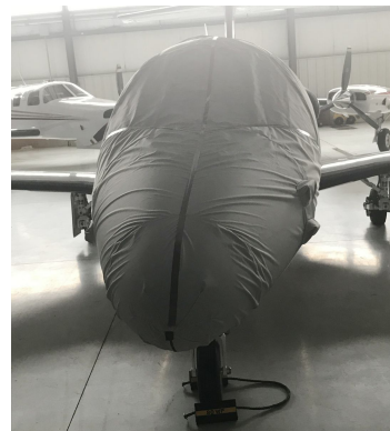
Eclipse EA550 Travel Canopy/Nose Cover