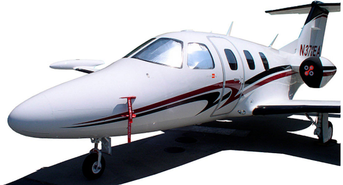
Cockpit HeatShields, Pitot Covers & "Bikini" style Engine Covers