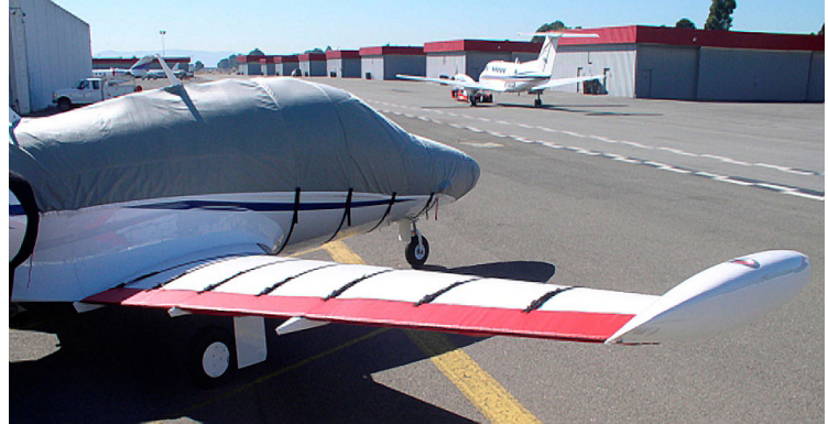
Fuselage Cover with Hail Protection & Wing Control Surfaces Hail Protection Pads