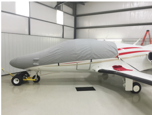
Eclipse Travel Weight Canopy/Nose Cover

This cover type is made from Silver Acrylic Sunbrella canvas and is 100% lined with a soft and smooth microfiber. Bruce's Custom Covers developed this material combination especially for aircraft protection. The outer material is medium weight and treated for water resistance, UV resistance and anti-static buildup. The inner lining is a very soft and smooth microfiber to prevent scratching. The material is very reflective, and tests show that the cabin interior temperature can be reduced to near-ambient temperature on the hottest of days. It is water, ice and snow repellent, yet breathable to allow moisture to escape from between the cover and the aircraft surface.