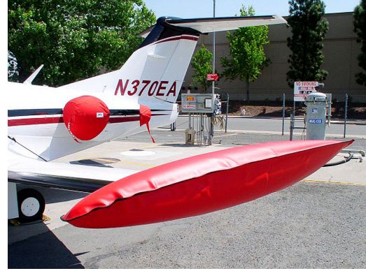
Eclipse Tip Tank & Engine Covers