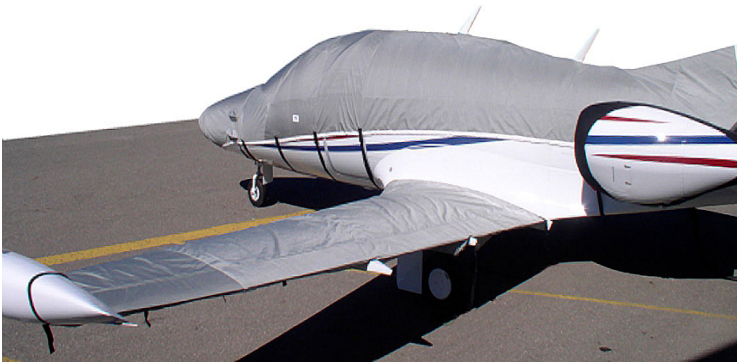
Fuselage Cover & Wing Covers with hail protection on all upper surfaces

This cover type is made from Silver Acrylic Sunbrella canvas and is 100% lined with a soft and smooth microfiber. Bruce's Custom Covers developed this material combination especially for aircraft protection. The outer material is medium weight and treated for water resistance, UV resistance and anti-static buildup. The inner lining is a very soft and smooth microfiber to prevent scratching. The material is very reflective, and tests show that the cabin interior temperature can be reduced to near-ambient temperature on the hottest of days. It is water, ice and snow repellent, yet breathable to allow moisture to escape from between the cover and the aircraft surface.