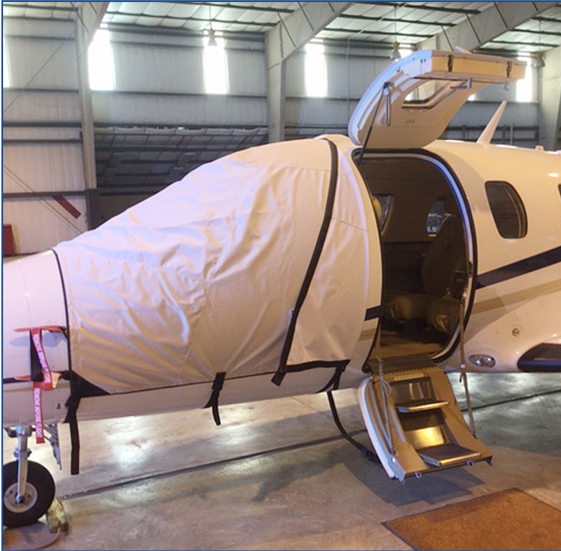
Eclipse Cockpit Door Cover, with Pitot Tube Covers