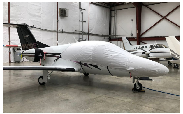
Eclipse EA500 Canopy/Nose Cover, Engine Covers