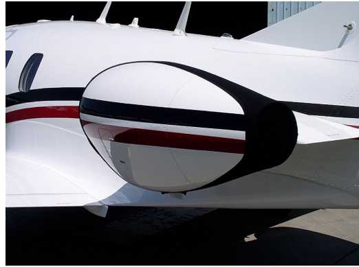
Bikini style Engine Covers