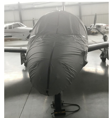
Eclipse EA550 Travel Canopy/Nose Cover