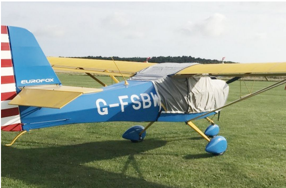
Eurofox Travel Weight Canopy/Engine Cover