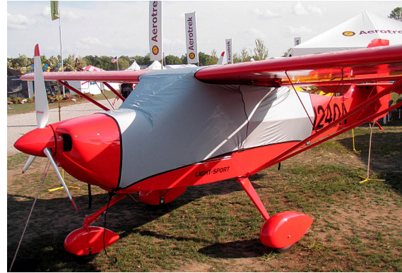
Aerotrek A240 Spandex FlyAway Travel Canopy Cover