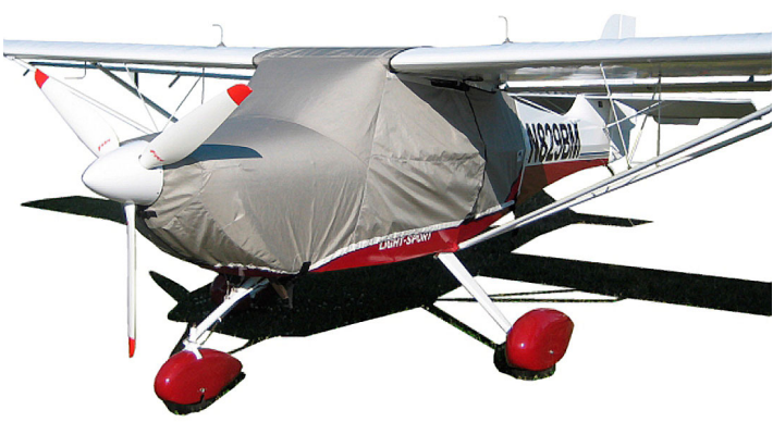
Aerotrek A240 Canopy/Engine Cover