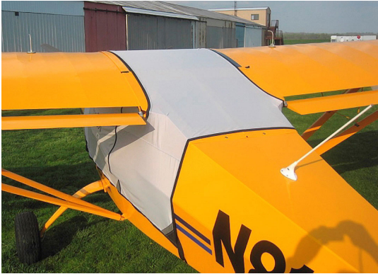
Aerotrek A240 Spandex FlyAway Travel Canopy Cover

Travel Covers are made with Silver Solution-Dyed Polyester fabric and only lined over the windshield to save weight. The material is lightweight and more compact for easy stowage in the aircraft. The polyester material is water resistant, but only intended for occasional use outside. We also have an ultra lightweight material available for fitted hangar dust covers. For daily outdoor use, the non-travel Sunbrella Cover is the best choice.