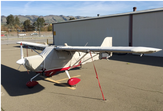
Eurofox Canopy, Engine, Wings and Empennage Covers

WINTER USE MATERIAL - Made with Solution-Dyed Polyester fabric, this option is intended for seasonal use to aid in deicing, rain mitigation, or for occasional travel. The material is lighter and more compact, but more susceptible to UV damage and may have a shorter useful life if used continuously outside than the all-year use material.