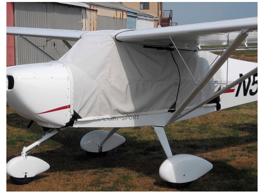
Aerotrek A240 Standard Canopy Cover