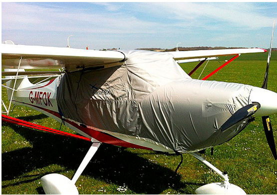
EuroFox and Aerotrek A240 Lightweight Travel Canopy/Engine Cover

This cover type is made from Silver Acrylic Sunbrella canvas and is 100% lined with a soft and smooth microfiber. Bruce's Custom Covers developed this material combination especially for aircraft protection. The outer material is medium weight and treated for water resistance, UV resistance and anti-static buildup. The inner lining is a very soft and smooth microfiber to prevent scratching. The material is very reflective, and tests show that the cabin interior temperature can be reduced to near-ambient temperature on the hottest of days. It is water, ice and snow repellent, yet breathable to allow moisture to escape from between the cover and the aircraft surface.