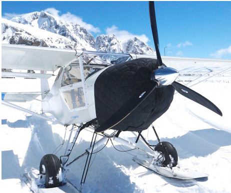
Kitfox Insulated Engine Cover

This cover type is made from Silver Acrylic Sunbrella canvas and is 100% lined with a soft and smooth microfiber. Bruce's Custom Covers developed this material combination especially for aircraft protection. The outer material is medium weight and treated for water resistance, UV resistance and anti-static buildup. The inner lining is a very soft and smooth microfiber to prevent scratching. The material is very reflective, and tests show that the cabin interior temperature can be reduced to near-ambient temperature on the hottest of days. It is water, ice and snow repellent, yet breathable to allow moisture to escape from between the cover and the aircraft surface.