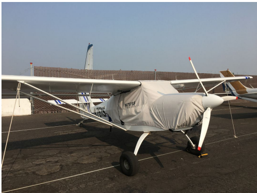
Eurofox Canopy/Engine Cover

This cover type is made from Silver Acrylic Sunbrella canvas and is 100% lined with a soft and smooth microfiber. Bruce's Custom Covers developed this material combination especially for aircraft protection. The outer material is medium weight and treated for water resistance, UV resistance and anti-static buildup. The inner lining is a very soft and smooth microfiber to prevent scratching. The material is very reflective, and tests show that the cabin interior temperature can be reduced to near-ambient temperature on the hottest of days. It is water, ice and snow repellent, yet breathable to allow moisture to escape from between the cover and the aircraft surface.