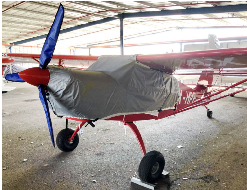
Eurofox Travel Weight Canopy/Engine Cover

Travel Covers are made with Silver Solution-Dyed Polyester fabric and only lined over the windshield to save weight. The material is lightweight and more compact for easy stowage in the aircraft. The polyester material is water resistant, but only intended for occasional use outside. We also have an ultra lightweight material available for fitted hangar dust covers. For daily outdoor use, the non-travel Sunbrella Cover is the best choice.