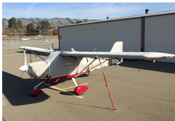
Eurofox Canopy, Engine, Wings and Empennage Covers