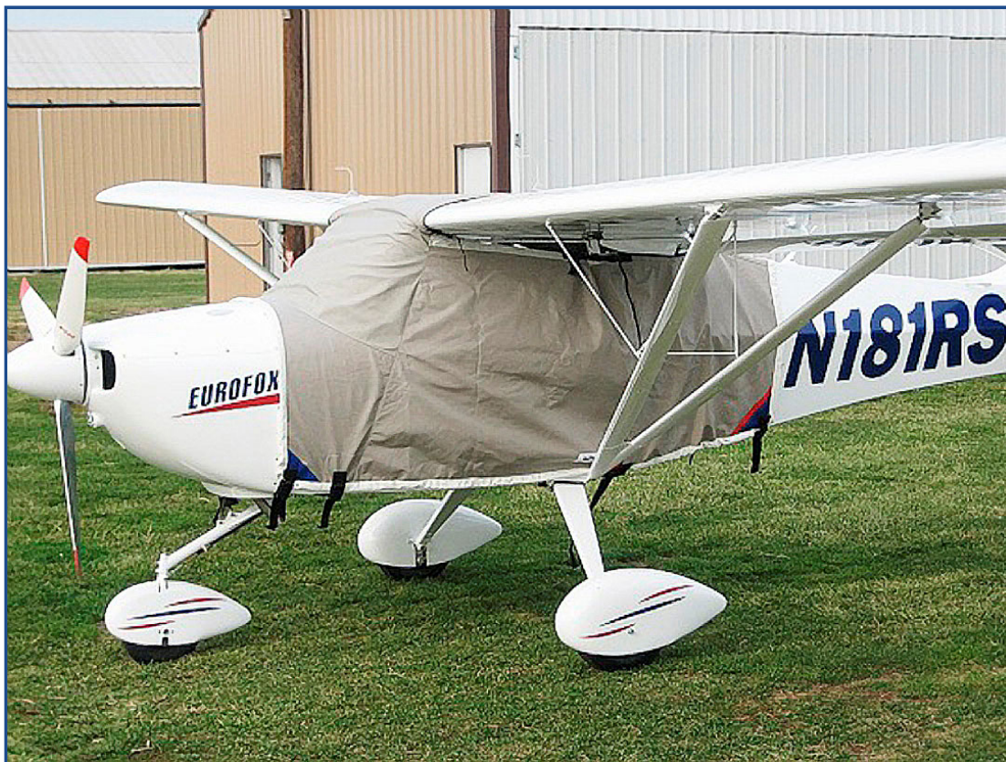
Eurofox LSA Extended Canopy Cover (same as an Aerotrek)