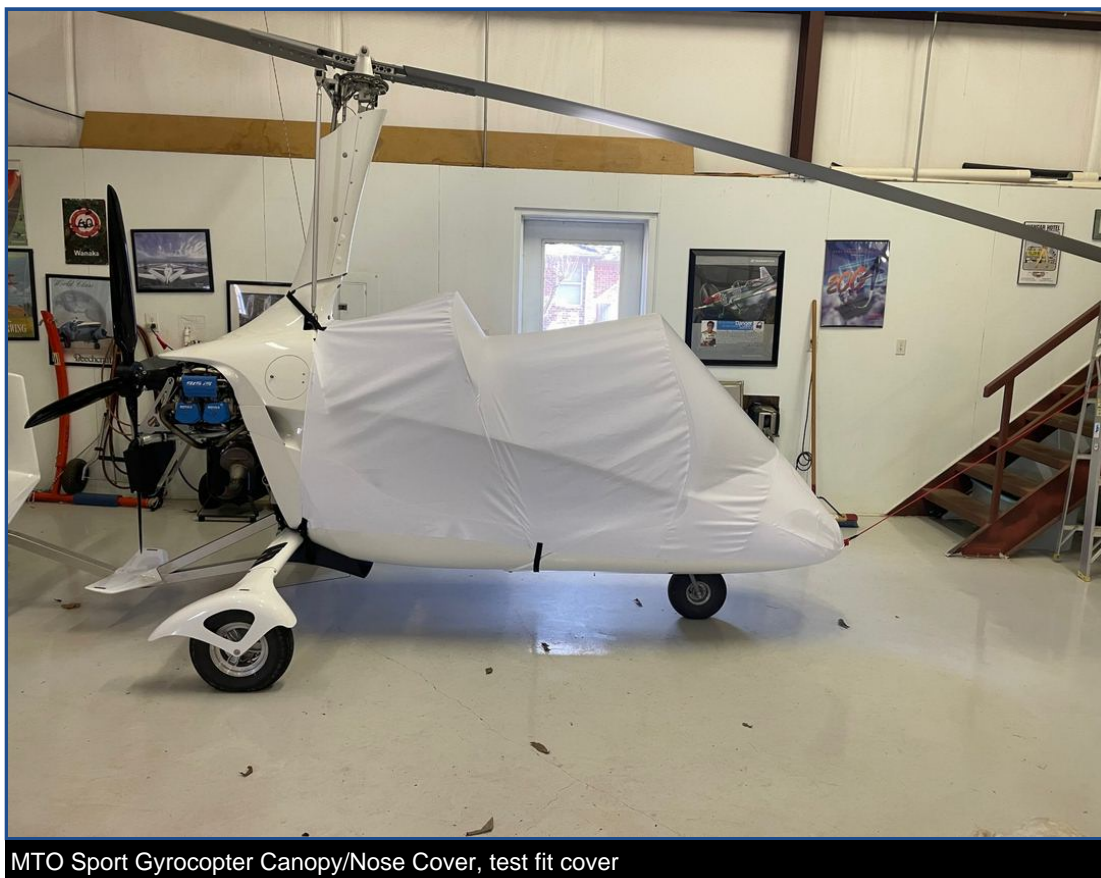
MTO Sport Gyrocopter Canopy/Nose Cover, test fit cover