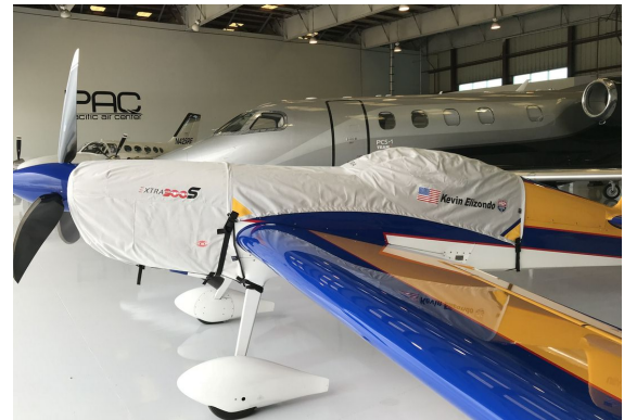
Extra 300S Canopy & Engine Covers