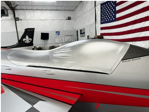
Extra NG Models Canopy Cover (SOLAR CAP EXAMPLE)