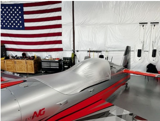
Extra NG Models Canopy Cover

Travel Covers are made with Silver Solution-Dyed Polyester fabric and only lined over the windshield to save weight. The material is lightweight and more compact for easy stowage in the aircraft. The polyester material is water resistant, but only intended for occasional use outside. We also have an ultra lightweight material available for fitted hangar dust covers. For daily outdoor use, the non-travel Sunbrella Cover is the best choice.