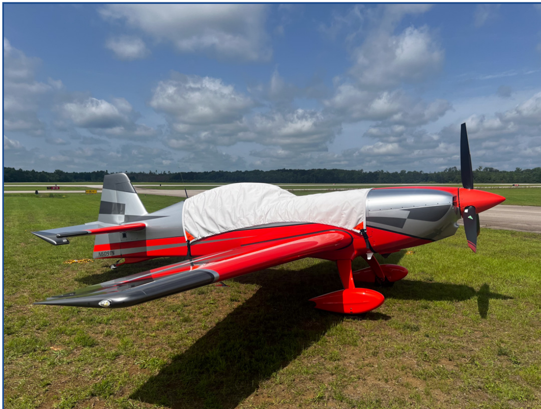
Extra NG Canopy Cover, Single Place Canopy