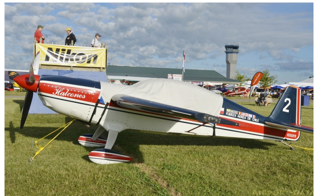
Extra 300 (mid-fuselage wing) Canopy Cover