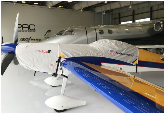
Extra 300S Canopy & Engine Covers

This cover type is made from Silver Acrylic Sunbrella canvas and is 100% lined with a soft and smooth microfiber. Bruce's Custom Covers developed this material combination especially for aircraft protection. The outer material is medium weight and treated for water resistance, UV resistance and anti-static buildup. The inner lining is a very soft and smooth microfiber to prevent scratching. The material is very reflective, and tests show that the cabin interior temperature can be reduced to near-ambient temperature on the hottest of days. It is water, ice and snow repellent, yet breathable to allow moisture to escape from between the cover and the aircraft surface.