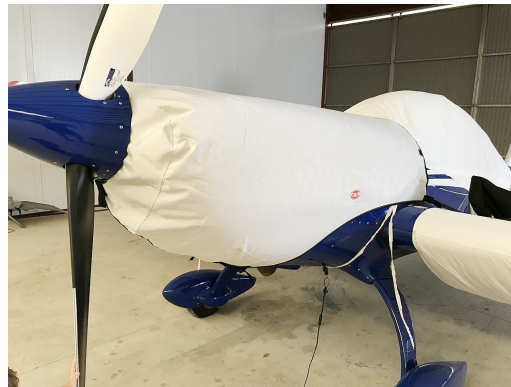
Extra 300, 330SC & 200/230 Models Engine Cover