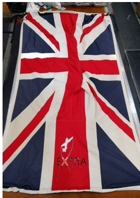
Custom Full-Cover Artwork

This cover type is made from Silver Acrylic Sunbrella canvas and is 100% lined with a soft and smooth microfiber. Bruce's Custom Covers developed this material combination especially for aircraft protection. The outer material is medium weight and treated for water resistance, UV resistance and anti-static buildup. The inner lining is a very soft and smooth microfiber to prevent scratching. The material is very reflective, and tests show that the cabin interior temperature can be reduced to near-ambient temperature on the hottest of days. It is water, ice and snow repellent, yet breathable to allow moisture to escape from between the cover and the aircraft surface.