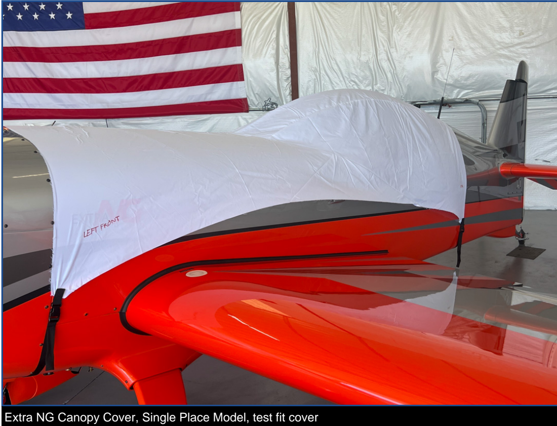
Extra NG Canopy Cover, Single Place Model, test fit cover