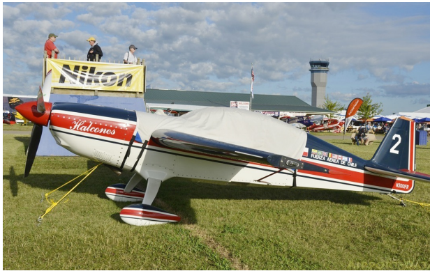
Extra 300 (mid-fuselage wing) Canopy Cover

This cover type is made from Silver Acrylic Sunbrella canvas and is 100% lined with a soft and smooth microfiber. Bruce's Custom Covers developed this material combination especially for aircraft protection. The outer material is medium weight and treated for water resistance, UV resistance and anti-static buildup. The inner lining is a very soft and smooth microfiber to prevent scratching. The material is very reflective, and tests show that the cabin interior temperature can be reduced to near-ambient temperature on the hottest of days. It is water, ice and snow repellent, yet breathable to allow moisture to escape from between the cover and the aircraft surface.