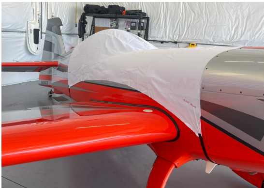
Extra NG Canopy Cover, Single Place Model, test fit cover