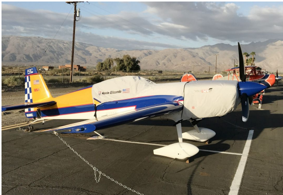
Extra 300S Canopy & Engine Covers