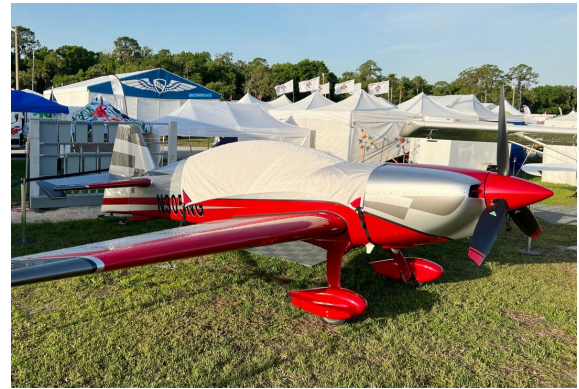
Extra NG Canopy Cover