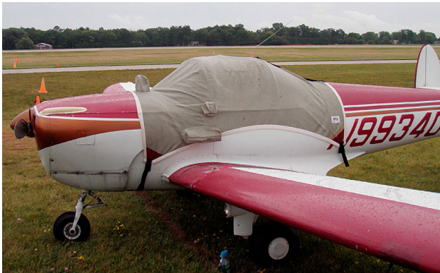
Ercoupe Canopy Cover, flat windshield model

Travel Covers are made with Silver Solution-Dyed Polyester fabric and only lined over the windshield to save weight. The material is lightweight and more compact for easy stowage in the aircraft. The polyester material is water resistant, but only intended for occasional use outside. We also have an ultra lightweight material available for fitted hangar dust covers. For daily outdoor use, the non-travel Sunbrella Cover is the best choice.