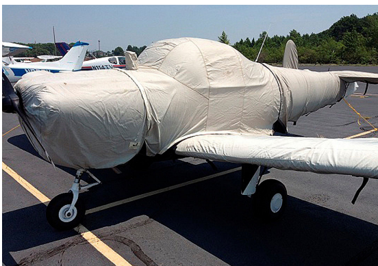
Ercoupe full cover set: Extended Canopy, Engine, Wing & Empennage covers

WINTER USE MATERIAL - Made with Solution-Dyed Polyester fabric, this option is intended for seasonal use to aid in deicing, rain mitigation, or for occasional travel. The material is lighter and more compact, but more susceptible to UV damage and may have a shorter useful life if used continuously outside than the all-year use material.