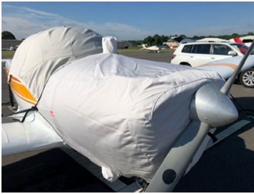
Ercoupe 415-C Fully Enclosed Engine Cover