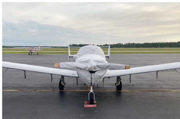
Ercoupe Complete Cover Set