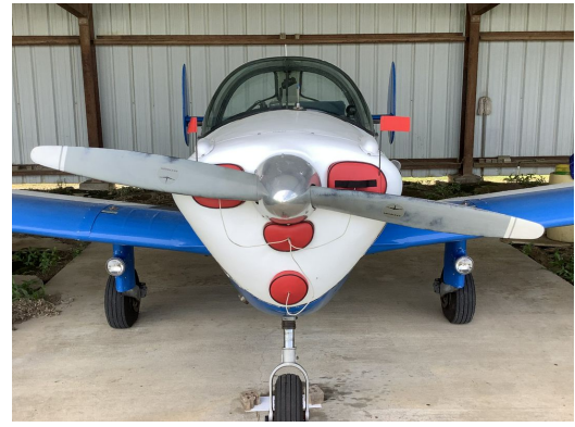
Ercoupe Engine Inlet Plugs