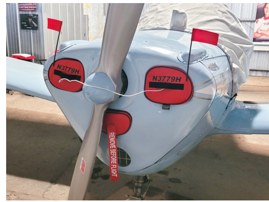
Ercoupe Engine Inlet Plugs