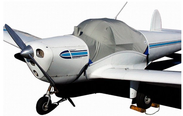
Ercoupe Canopy Cover, bubble windshield model