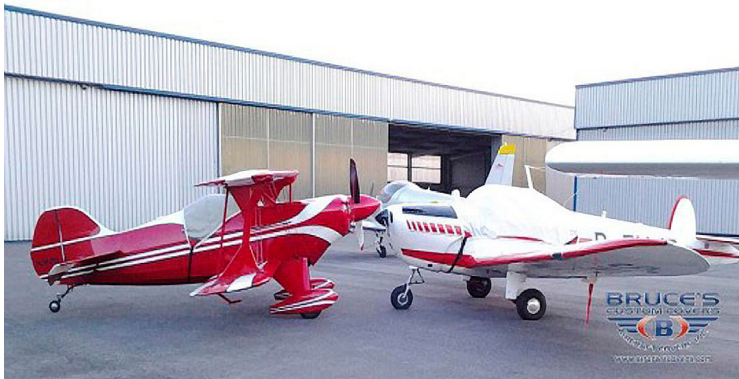
Pitts & Ercoupe Canopy Covers

This cover type is made from Silver Acrylic Sunbrella canvas and is 100% lined with a soft and smooth microfiber. Bruce's Custom Covers developed this material combination especially for aircraft protection. The outer material is medium weight and treated for water resistance, UV resistance and anti-static buildup. The inner lining is a very soft and smooth microfiber to prevent scratching. The material is very reflective, and tests show that the cabin interior temperature can be reduced to near-ambient temperature on the hottest of days. It is water, ice and snow repellent, yet breathable to allow moisture to escape from between the cover and the aircraft surface.