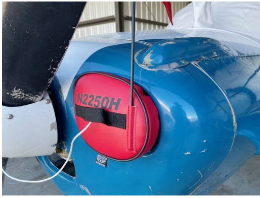
Ercoupe Engine Plugs