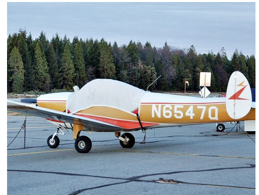
Alon Ercoupe Canopy Cover