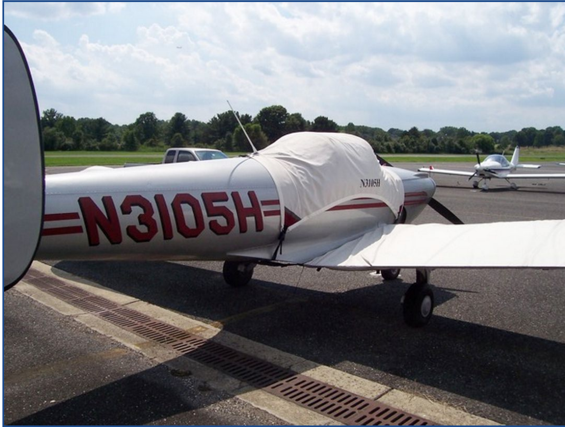
Ercoupe Canopy Cover