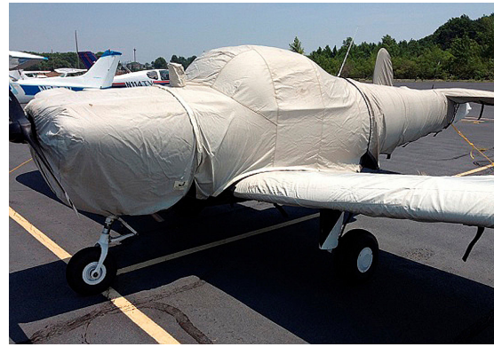
Ercoupe full cover set: Extended Canopy, Engine, Wing & Empennage covers