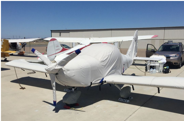
2017 Evector Sportstar Max All Year Use Wing Covers