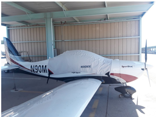
Evektor Sportstar Max Canopy Cover

This cover type is made from Silver Acrylic Sunbrella canvas and is 100% lined with a soft and smooth microfiber. Bruce's Custom Covers developed this material combination especially for aircraft protection. The outer material is medium weight and treated for water resistance, UV resistance and anti-static buildup. The inner lining is a very soft and smooth microfiber to prevent scratching. The material is very reflective, and tests show that the cabin interior temperature can be reduced to near-ambient temperature on the hottest of days. It is water, ice and snow repellent, yet breathable to allow moisture to escape from between the cover and the aircraft surface.