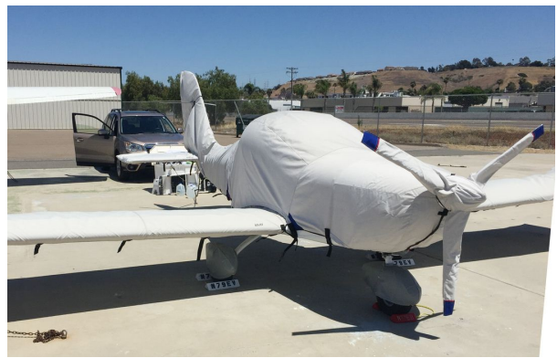
2017 Evektor Sportstar Max Extended Canopy/Engine Cover