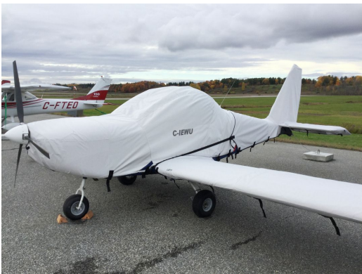
Evektor Sportstar Full Cover Set