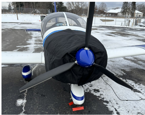
Evektor Harmony Insulated Engine Cover