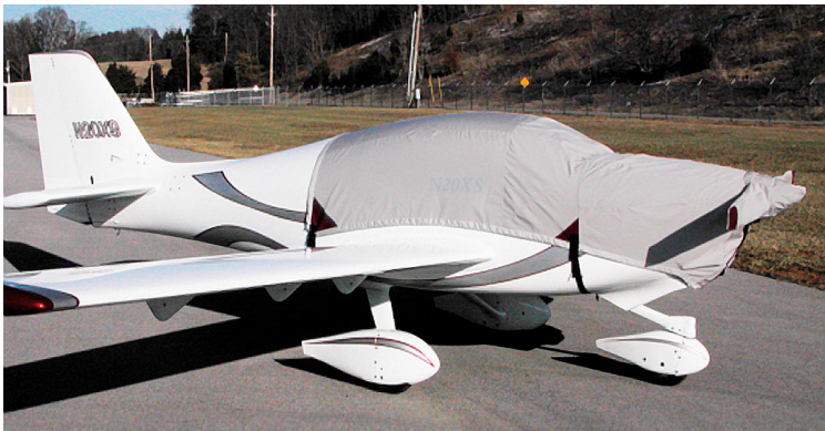
Canopy/Engine and Prop/Spinner Covers (tri-gear model)

The Europa All Europa Models Canopy/Engine Cover is a one-piece cover (100% lined with microfiber) that is a combination of the Canopy Cover and Engine Cover. This cover will enclose the engine cowl and will extend aft to cover all of the windows. This cover type is made from Silver Acrylic Sunbrella canvas and is 100% lined with a soft and smooth microfiber. Bruce's Custom Covers developed this material combination especially for aircraft protection. The outer material is medium weight and treated for water resistance, UV resistance and anti-static buildup. The inner lining is a very soft and smooth microfiber to prevent scratching. The material is very reflective, and tests show that the cabin interior temperature can be reduced to near-ambient temperature on the hottest of days. It is water, ice and snow repellent, yet breathable to allow moisture to escape from between the cover and the aircraft surface.