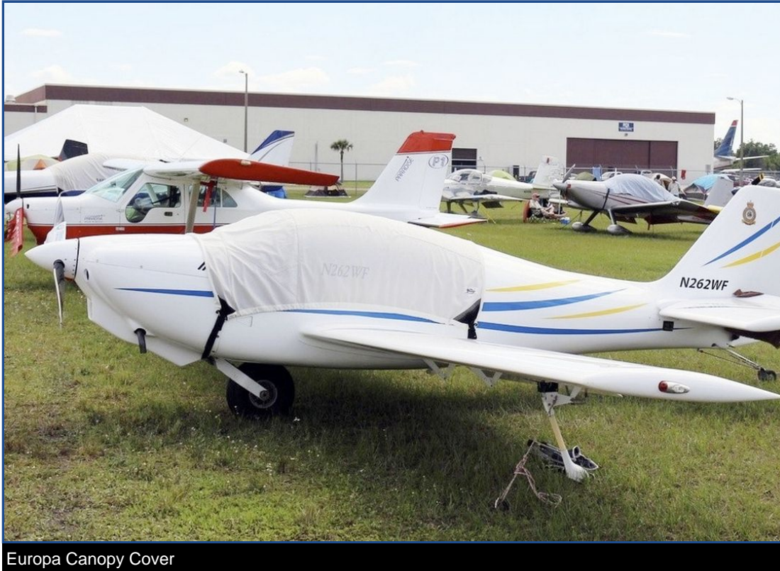
Europa Canopy Cover