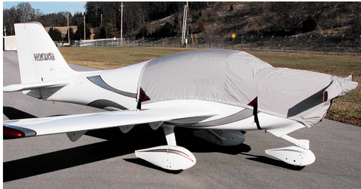
Canopy/Engine and Prop/Spinner Covers (tri-gear model)

This cover type is made from Silver Acrylic Sunbrella canvas and is 100% lined with a soft and smooth microfiber. Bruce's Custom Covers developed this material combination especially for aircraft protection. The outer material is medium weight and treated for water resistance, UV resistance and anti-static buildup. The inner lining is a very soft and smooth microfiber to prevent scratching. The material is very reflective, and tests show that the cabin interior temperature can be reduced to near-ambient temperature on the hottest of days. It is water, ice and snow repellent, yet breathable to allow moisture to escape from between the cover and the aircraft surface.