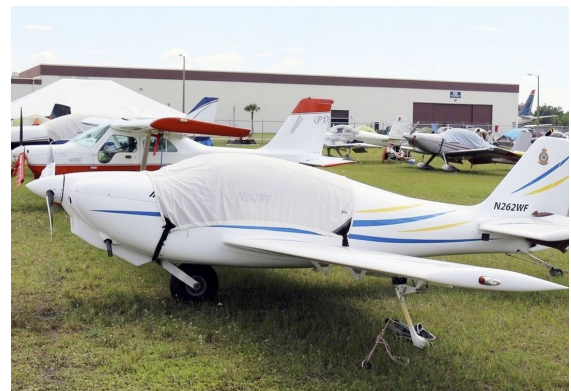
Europa Canopy Cover