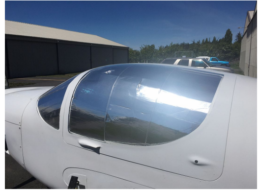
Europa Cabin HeatShields