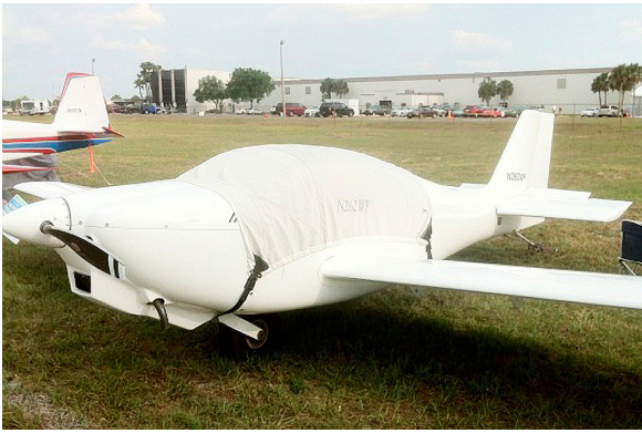
Europa XS Canopy Cover