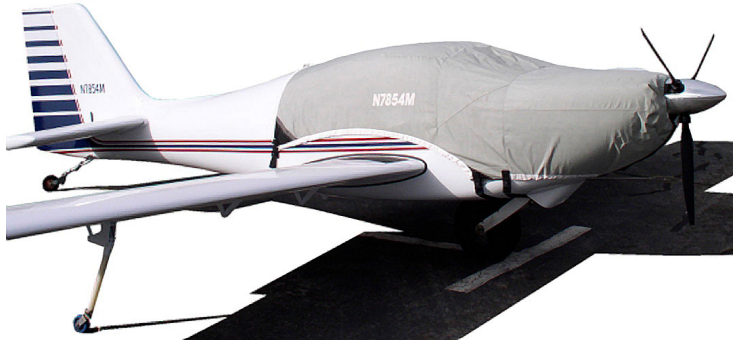
Europa Canopy/Engine Cover