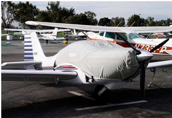
Europa Canopy/Engine Cover