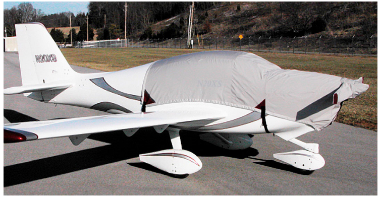
Canopy/Engine and Prop/Spinner Covers (tri-gear model)