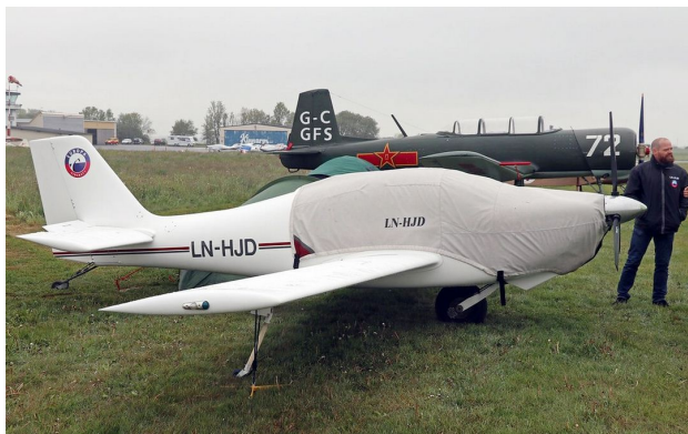
Europa Canopy/Engine Cover

The Europa All Europa Models Canopy/Engine Cover is a one-piece cover (100% lined with microfiber) that is a combination of the Canopy Cover and Engine Cover. This cover will enclose the engine cowl and will extend aft to cover all of the windows. This cover type is made from Silver Acrylic Sunbrella canvas and is 100% lined with a soft and smooth microfiber. Bruce's Custom Covers developed this material combination especially for aircraft protection. The outer material is medium weight and treated for water resistance, UV resistance and anti-static buildup. The inner lining is a very soft and smooth microfiber to prevent scratching. The material is very reflective, and tests show that the cabin interior temperature can be reduced to near-ambient temperature on the hottest of days. It is water, ice and snow repellent, yet breathable to allow moisture to escape from between the cover and the aircraft surface.