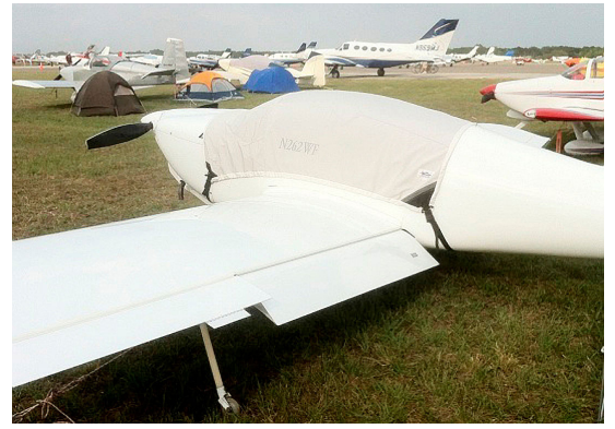
Europa XS Canopy Cover