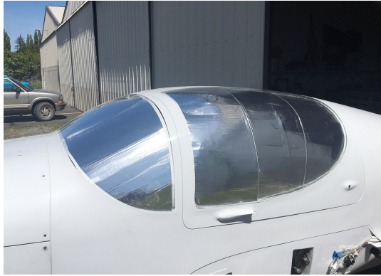
Europa Cabin HeatShields

Heatshields are interior sunshades for an aircraft's windows or canopy glass. The product is a unique composite of closed-cell foam with a silver mylar finish. The semi-rigid design is stiff enough to stand along the inside of the windshield using sun visors or window framing. It folds up flat and easily stores in the included storage sleeve. Some designs may require velcro and suction cups. A Heatshield is an excellent short-term remedy for cockpit overheating.