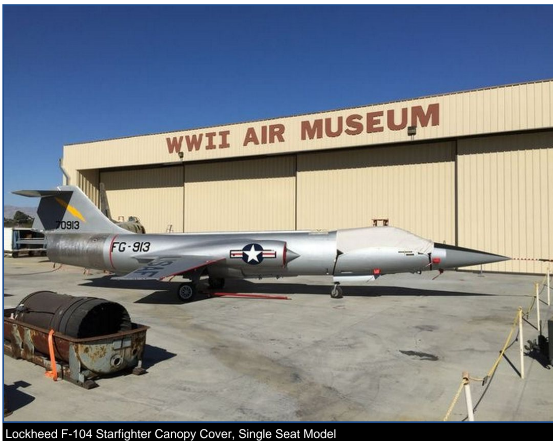
Lockheed F-104 Starfighter Canopy Cover, Single Seat Model