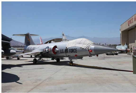
Lockheed F104 Canopy Cover, Intake Plugs