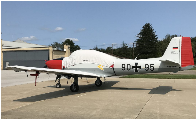
Focke Wulf F149 Canopy Cover, Wing Covers

WINTER USE MATERIAL - Made with Solution-Dyed Polyester fabric, this option is intended for seasonal use to aid in deicing, rain mitigation, or for occasional travel. The material is lighter and more compact, but more susceptible to UV damage and may have a shorter useful life if used continuously outside than the all-year use material.