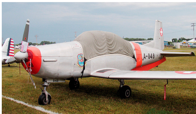
Piaggio P-149D Trainer Canopy Cover

of the Canopy Cover and Engine Cover. This cover will enclose the engine cowl and will extend aft to cover all of the windows. This cover type is made from Silver Acrylic Sunbrella canvas and is 100% lined with a soft and smooth microfiber. Bruce's Custom Covers developed this material combination especially for aircraft protection. The outer material is medium weight and treated for water resistance, UV resistance and anti-static buildup. The inner lining is a very soft and smooth microfiber to prevent scratching. The material is very reflective, and tests show that the cabin interior temperature can be reduced to near-ambient temperature on the hottest of days. It is water, ice and snow repellent, yet breathable to allow moisture to escape from between the cover and the aircraft surface.