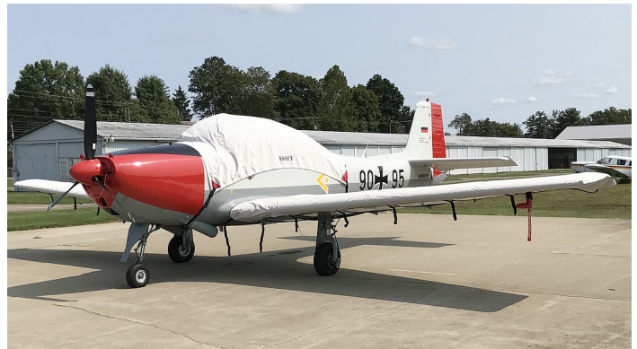
Focke Wulf F149 Canopy Cover, Wing Covers, Engine Plugs