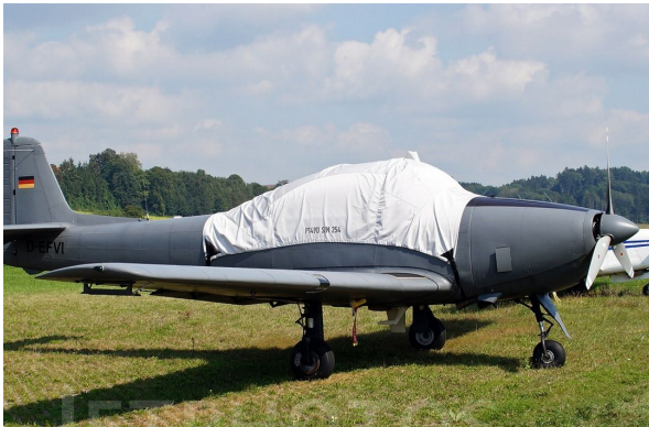
Piaggio P-149 Canopy Cover

of the Canopy Cover and Engine Cover. This cover will enclose the engine cowl and will extend aft to cover all of the windows. This cover type is made from Silver Acrylic Sunbrella canvas and is 100% lined with a soft and smooth microfiber. Bruce's Custom Covers developed this material combination especially for aircraft protection. The outer material is medium weight and treated for water resistance, UV resistance and anti-static buildup. The inner lining is a very soft and smooth microfiber to prevent scratching. The material is very reflective, and tests show that the cabin interior temperature can be reduced to near-ambient temperature on the hottest of days. It is water, ice and snow repellent, yet breathable to allow moisture to escape from between the cover and the aircraft surface.