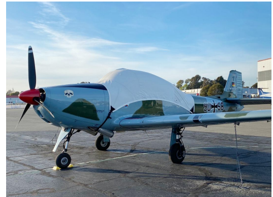
Focke Wulf 149 Trainer Canopy Cover