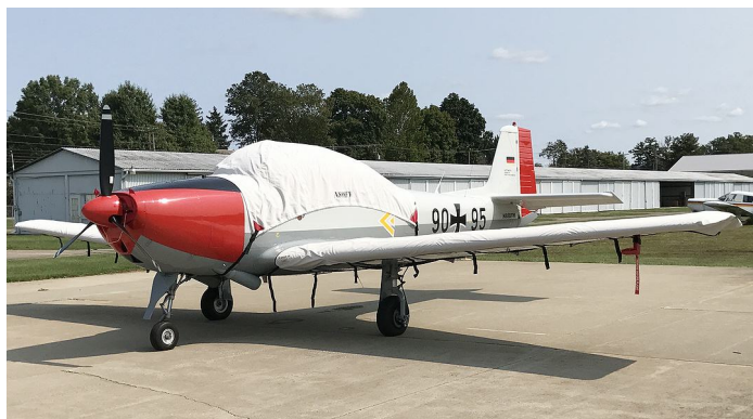
Focke Wulf F149 Canopy Cover, Wing Covers, Engine Plugs