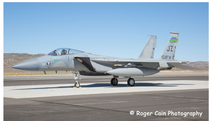
McDonnell-Douglas F-15 Intake Covers