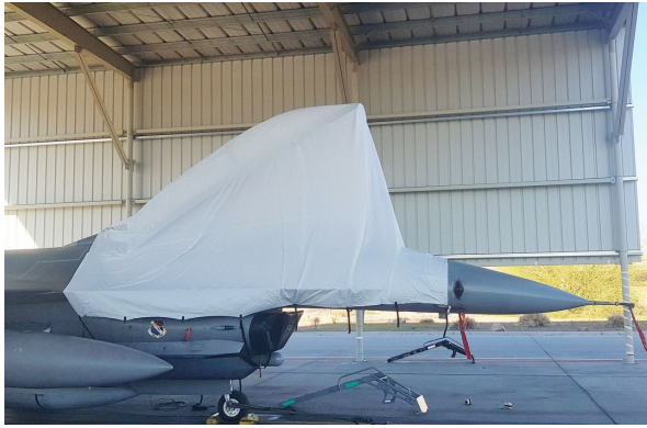
McDonnell Douglas F16-D Canopy Cover, open cockpit type (test fit cover)

Canopy Covers are commonly referred to as Cabin Covers, Fuselage Covers, Canvas Covers, Canopy Caps, etc.