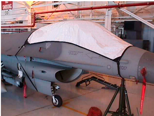
F-16 "Blackout" type Canopy Cover

Canopy Covers are commonly referred to as Cabin Covers, Fuselage Covers, Canvas Covers, Canopy Caps, etc.