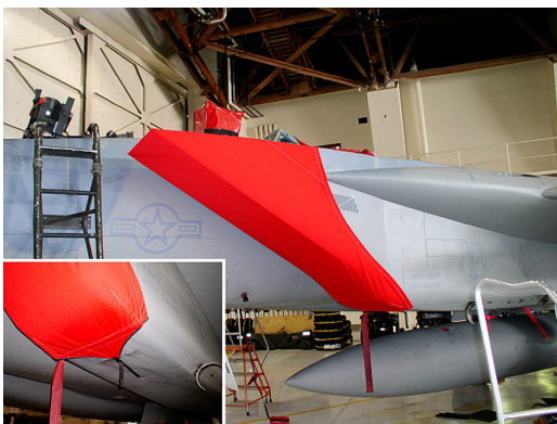
Intake Cover, Attachment Detail (inset)

The McDonnell Douglas F-15 Eagle Intake Covers are designed to install easily yet be completely storable. A spring steel hoop is sewn into the hem of each cover, allowing them to be installed without climbing onto the wing or using a stepladder. To store the covers the spring steel hoop folds like a band-saw blade into three nesting rings. Each cover folds into a compact circular bundle which is stored in the included duffle bag, yet they unfold quickly for use. The Tri-Fold Ring cover is made of medium weight nylon which is available in a variety of colors to match the paint trim. Each cover set comes complete with installation and folding instructions. The aircraft's registration number can be silkscreened onto the cover for an extra charge.