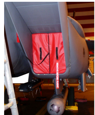
F15 Intake Plugs