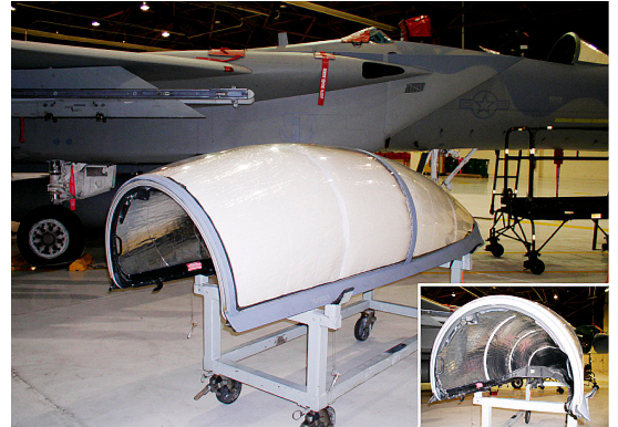
F-15 Cockpit HeatShield