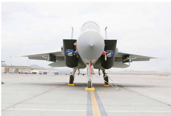
McDonnell-Douglas F-15 Intake Covers

The McDonnell Douglas F-15 Eagle Intake Covers are designed to install easily yet be completely storable. A spring steel hoop is sewn into the hem of each cover, allowing them to be installed without climbing onto the wing or using a stepladder. To store the covers the spring steel hoop folds like a band-saw blade into three nesting rings. Each cover folds into a compact circular bundle which is stored in the included duffel bag, yet they unfold quickly for use. The Tri-Fold Ring cover is made of medium weight nylon which is available in a variety of colors to match the paint trim. Each cover set comes complete with installation and folding instructions. The aircraft's registration number can be silkscreened onto the cover for an extra charge.