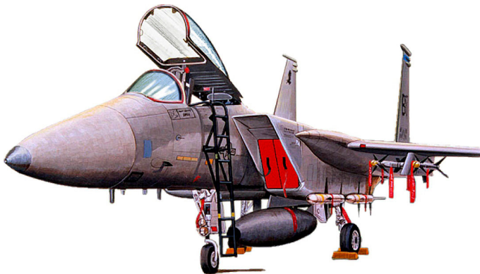
F15 Cockpit HeatShields & Intake Plugs

The Engine Inlet Plugs are custom fit for your McDonnell Douglas F-15 Eagle intakes, made with heavy-duty vinyl material, and stuffed with a single block of sculpted urethane foam. Each plug has a zipper that allows the foam to be removed and dried if necessary. Engine plugs have 'remove before flight' streamers sewn onto the face of the plugs. Most plugs are imprinted with the aircraft registration number in black for an extra charge. Storage bag NOT included. Engine plugs may be inserted after flight when the engine is still warm. Engine Inlet Plugs are commonly referred to as Cowl Plugs, Intake Plugs, Cowl Blocks, Engine Blocks, and Engine Bunges.