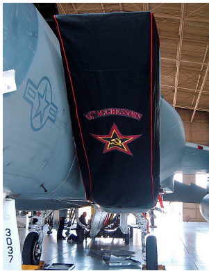
F15 Intake Cover

The McDonnell Douglas F-15 Eagle Intake Covers are designed to install easily yet be completely storable. A spring steel hoop is sewn into the hem of each cover, allowing them to be installed without climbing onto the wing or using a stepladder. To store the covers the spring steel hoop folds like a band-saw blade into three nesting rings. Each cover folds into a compact circular bundle which is stored in the included duffle bag, yet they unfold quickly for use. The Tri-Fold Ring cover is made of medium weight nylon which is available in a variety of colors to match the paint trim. Each cover set comes complete with installation and folding instructions. The aircraft's registration number can be silkscreened onto the cover for an extra charge.