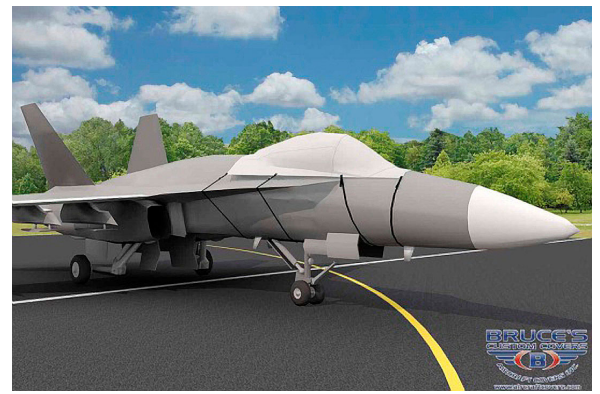
F-18 Canopy Cover, illustration