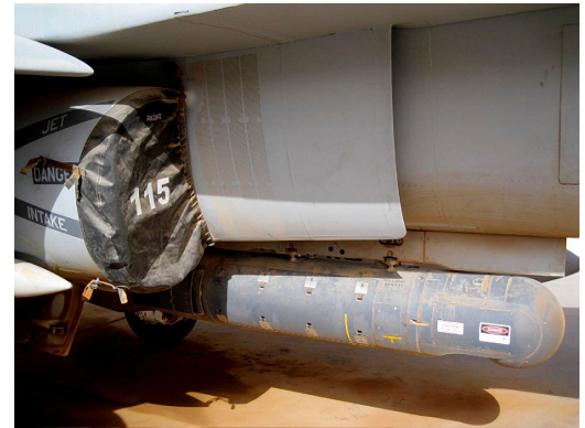
F-18 Intake Covers