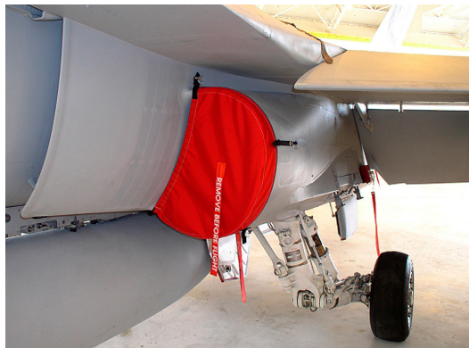
F-18 Engine Inlet Cover

The McDonnell Douglas F-18 Hornet, Super Hornet Intake Covers are designed to install easily yet be completely storable. A spring steel hoop is sewn into the hem of each cover, allowing them to be installed without climbing onto the wing or using a step ladder. To store the covers the spring steel hoop folds like a band-saw blade into three nesting rings. Each cover folds into a compact circular bundle which is stored in the included duffle bag, yet they unfold quickly for use. The Tri-Fold Ring cover is made of medium weight nylon which is available in a variety of colors to match the paint trim. Each cover set comes complete with installation and folding instructions. The aircraft's registration number can be silkscreened onto the cover for an extra charge.