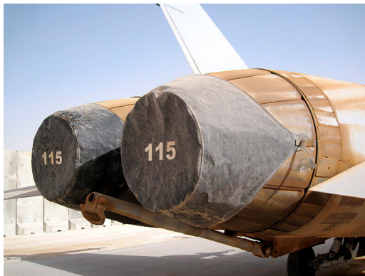
F-18 Exhaust Covers

The McDonnell Douglas F-18 Hornet, Super Hornet Intake Covers are designed to install easily yet be completely storable. A spring steel hoop is sewn into the hem of each cover, allowing them to be installed without climbing onto the wing or using a stepladder. To store the covers the spring steel hoop folds like a band-saw blade into three nesting rings. Each cover folds into a compact circular bundle which is stored in the included duffle bag, yet they unfold quickly for use. The Tri-Fold Ring cover is made of medium weight nylon which is available in a variety of colors to match the paint trim. Each cover set comes complete with installation and folding instructions. The aircraft's registration number can be silkscreened onto the cover for an extra charge.