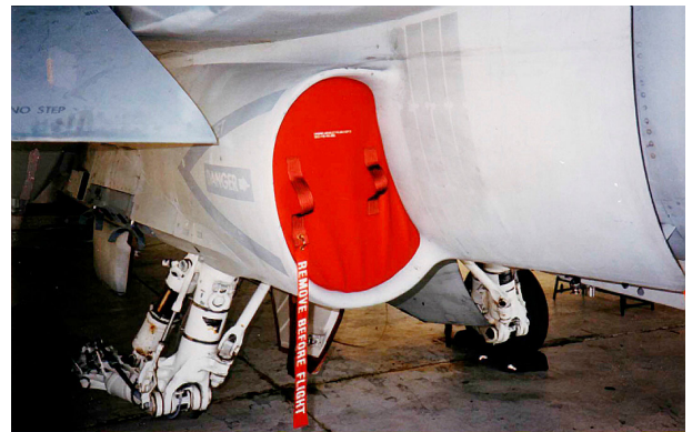
Engine Inlet Plug