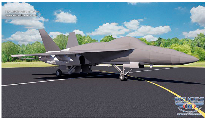
F-18 Storage Covers, 3D rendering