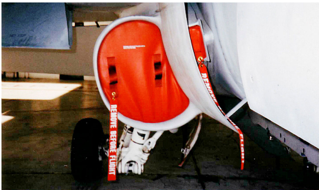
Engine & ECS Inlet Plugs

The Engine Inlet Plugs are custom fit for your McDonnell Douglas F-18 Hornet, Super Hornet intakes, made with heavy-duty vinyl material, and stuffed with a single block of sculpted urethane foam. Each plug has a zipper that allows the foam to be removed and dried if necessary. Engine plugs have 'remove before flight' streamers sewn onto the face of the plugs. Most plugs are imprinted with the aircraft registration number in black for an extra charge. Storage bag NOT included. Engine plugs may be inserted after flight when the engine is still warm. Engine Inlet Plugs are commonly referred to as Cowl Plugs, Intake Plugs, Cowl Blocks, Engine Blocks, and Engine Bungs.