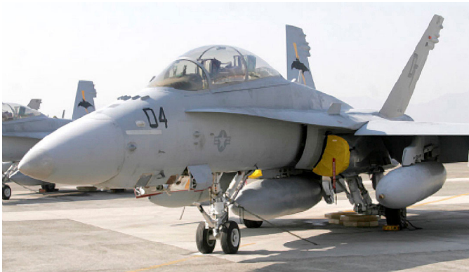
F-18 Intake Cover Set

The McDonnell Douglas F-18 Hornet, Super Hornet Intake Covers are designed to install easily yet be completely storable. A spring steel hoop is sewn into the hem of each cover, allowing them to be installed without climbing onto the wing or using a step ladder. To store the covers the spring steel hoop folds like a band-saw blade into three nesting rings. Each cover folds into a compact circular bundle which is stored in the included duffle bag, yet they unfold quickly for use. The Tri-Fold Ring cover is made of medium weight nylon which is available in a variety of colors to match the paint trim. Each cover set comes complete with installation and folding instructions. The aircraft's registration number can be silkscreened onto the cover for an extra charge.