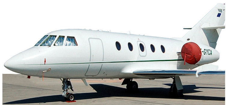
Falcon Engine Cover & Cockpit HeatShields