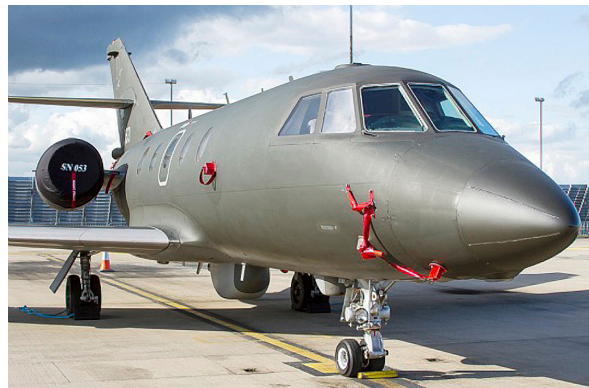
Falcon Engine Covers (not our probe covers)

The Falcon Jet 20 (HU-25) Intake/Exhaust Plugs are custom fit for the intake and exhaust openings, made with heavy-duty vinyl material, and stuffed with a single block of sculpted urethane foam. Each plug has a zipper that allows the foam to be removed and dried if necessary. Engine plugs have 'remove before flight' streamers sewn onto the face of the plugs. Most plugs are imprinted with the aircraft registration number in black. Engine plugs may be inserted after flight when the engine is still warm. Engine Inlet Plugs are commonly referred to as Cowl Plugs, Intake Plugs, Cowl Blocks, Engine Blocks, and Engine Bungs.