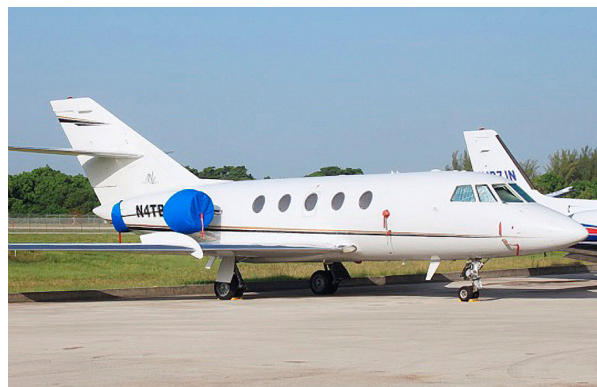
Falcon Engine Cover & Cockpit HeatShields