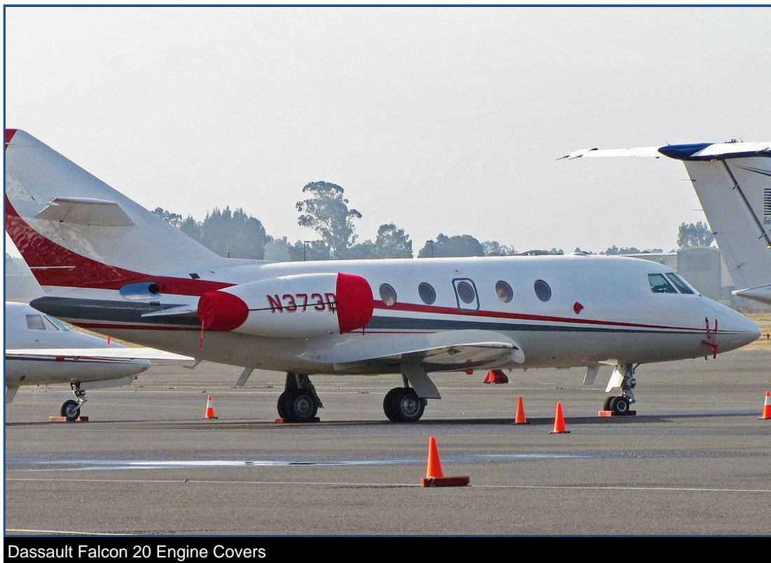
Dassault Falcon 20 Engine Covers