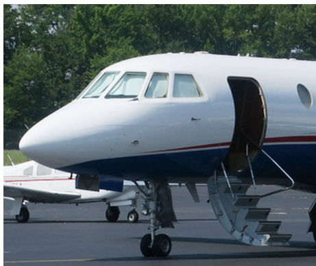
Dassault Falcon 50 Cockpit HeatShields

Cockpit Heatshields are interior sunshades for the aircraft's cockpit. The product is a unique composite of closed-cell foam with a silver mylar finish. The semi-rigid design is stiff enough to stand inside the window framing. The set folds up flat and is easily stored in the included storage sleeve. Some designs may require velcro and suction cups. Our Heatshields for jets are offered white side out because some aircraft manufacturers have issued advisories against reflective window inserts due to potential heat damage. A Heatshield is an excellent short-term remedy for cockpit overheating, but an external fabric cover is more effective for long-term protection.