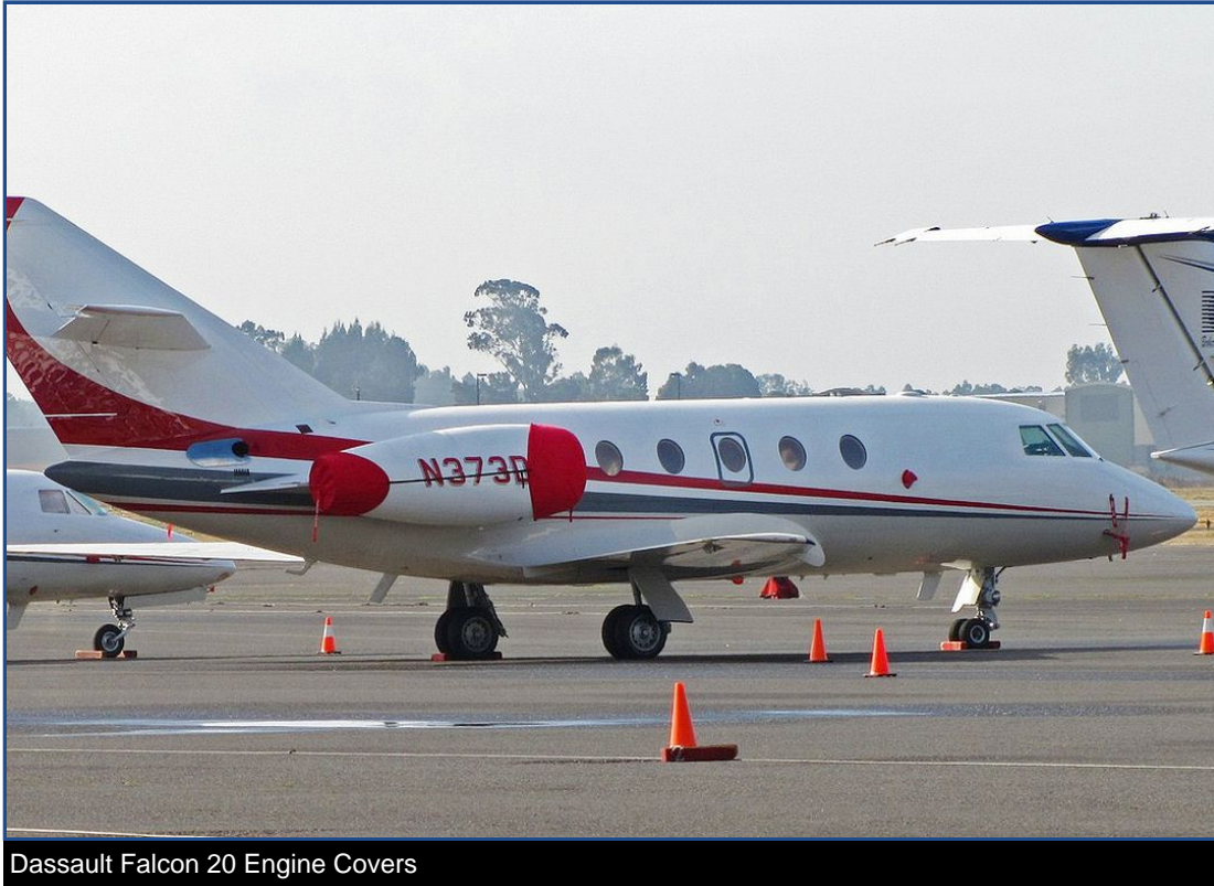
Dassault Falcon 20 Engine Covers