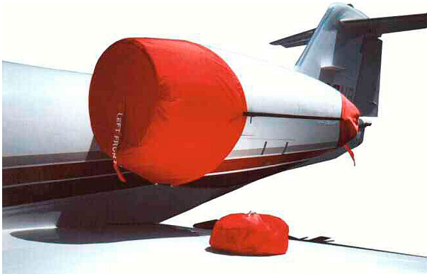
Lear 30 Tri-Fold Engine Cover