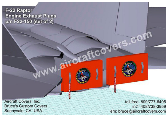
F-22 Exhaust Plugs, illustration