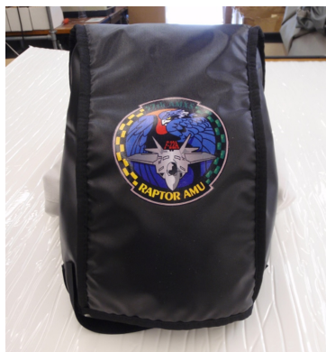
F-22 Raptor HUD Cover, padded

The Engine Inlet Plugs are custom fit for your Lockheed Martin/Boeing F-22 Raptor intakes, made with heavy-duty vinyl material, and stuffed with a single block of sculpted urethane foam. Each plug has a zipper that allows the foam to be removed and dried if necessary. Engine plugs have 'remove before flight' streamers sewn onto the face of the plugs. Most plugs are imprinted with the aircraft registration number in black for an extra charge. Storage bag NOT included. Engine plugs may be inserted after flight when the engine is still warm. Engine Inlet Plugs are commonly referred to as Cowl Plugs, Intake Plugs, Cowl Blocks, Engine Blocks, and Engine Bungs.