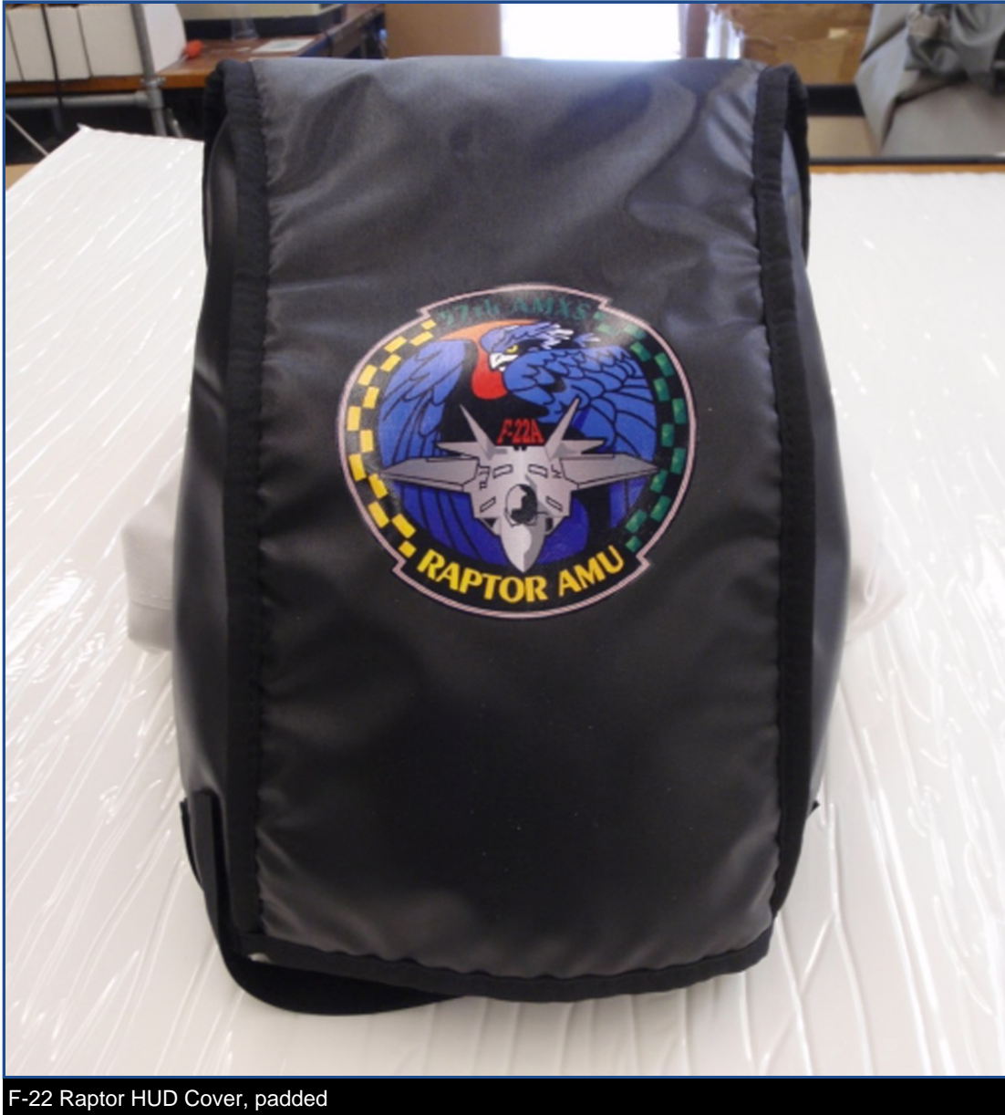
F-22 Raptor HUD Cover, padded