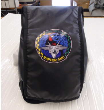
F-22 Raptor HUD Cover, padded