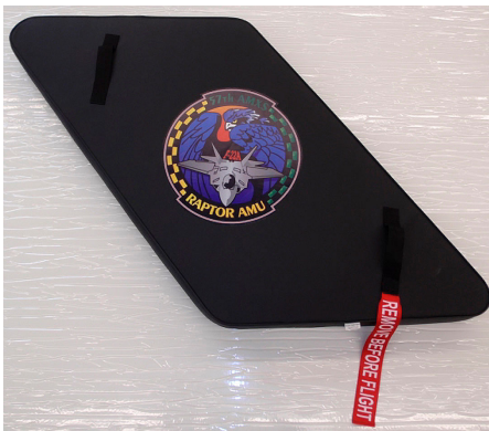
F-22 Raptor Engine Inlet Plug

The Engine Inlet Plugs are custom fit for your Lockheed Martin/Boeing F-22 Raptor intakes, made with heavy-duty vinyl material, and stuffed with a single block of sculpted urethane foam. Each plug has a zipper that allows the foam to be removed and dried if necessary. Engine plugs have 'remove before flight' streamers sewn onto the face of the plugs. Most plugs are imprinted with the aircraft registration number in black for an extra charge. Storage bag NOT included. Engine plugs may be inserted after flight when the engine is still warm. Engine Inlet Plugs are commonly referred to as Cowl Plugs, Intake Plugs, Cowl Blocks, Engine Blocks, and Engine Bungs.