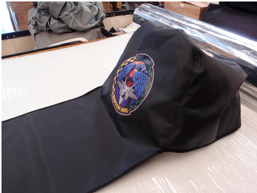
F22 Raptor Ejection Seat Maintenance Cover