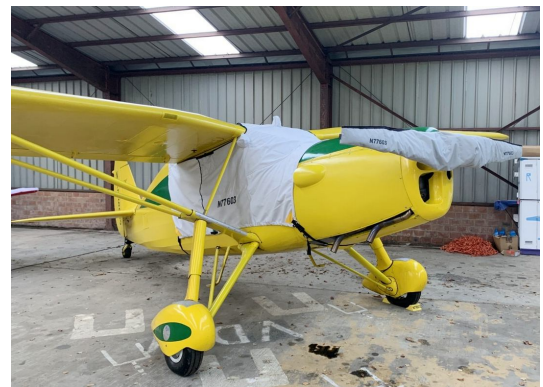
Fairchild 24 Over-Top Canopy Cover