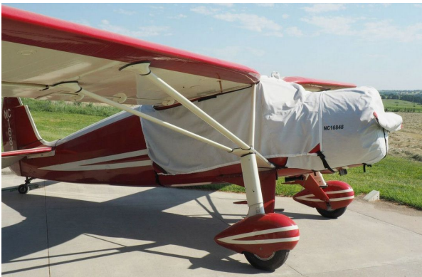
Fairchild 24W Canopy, Engine & Prop Cover