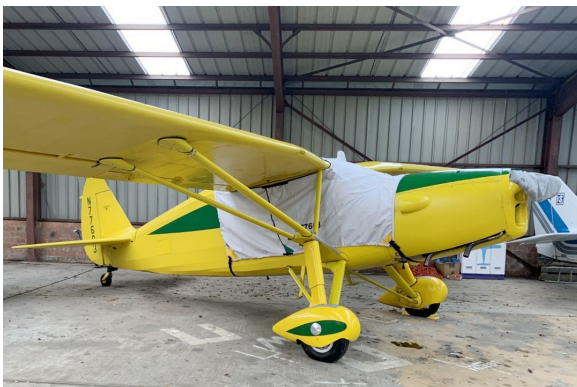
Fairchild 24 Over-Top Canopy Cover, Prop Cover

Travel Covers are made with Silver Solution-Dyed Polyester fabric and only lined over the windshield to save weight. The material is lightweight and more compact for easy stowage in the aircraft. The polyester material is water resistant, but only intended for occasional use outside. We also have an ultra lightweight material available for fitted hangar dust covers. For daily outdoor use, the non-travel Sunbrella Cover is the best choice.