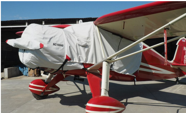
Fairchild 24W Canopy, Engine & Prop Cover