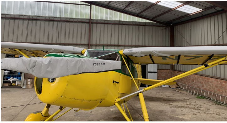
Fairchild 24 Wing & Prop Covers