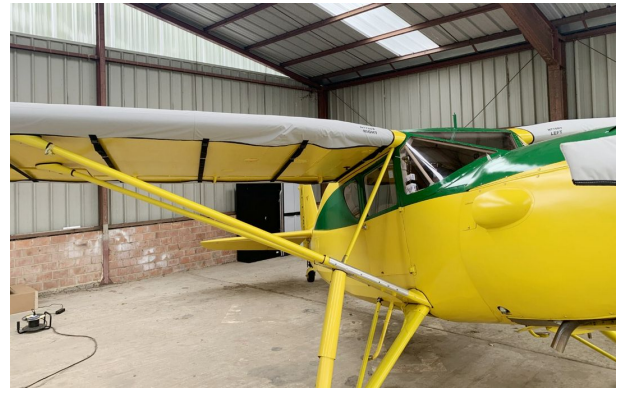
Fairchild 24 Wing Covers