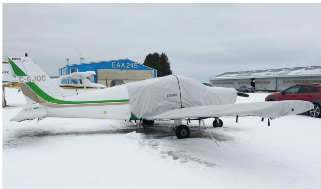
Piper PA-28 Extended Canopy/Engine, Wing & Horizontal Stabilizer Covers

mitigation, or for occasional travel. The material is lighter and more compact, but more susceptible to UV damage and may have a shorter useful life if used continuously outside than the all-year use material.