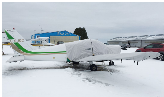
Piper PA-28 Extended Canopy/Engine, Wing & Horizontal Stabilizer Covers

mitigation, or for occasional travel. The material is lighter and more compact, but more susceptible to UV damage and may have a shorter useful life if used continuously outside than the all-year use material.