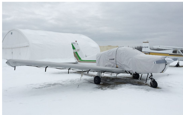
Piper PA-28 Extended Canopy/Engine, Wing & Horizontal Stabilizer Covers