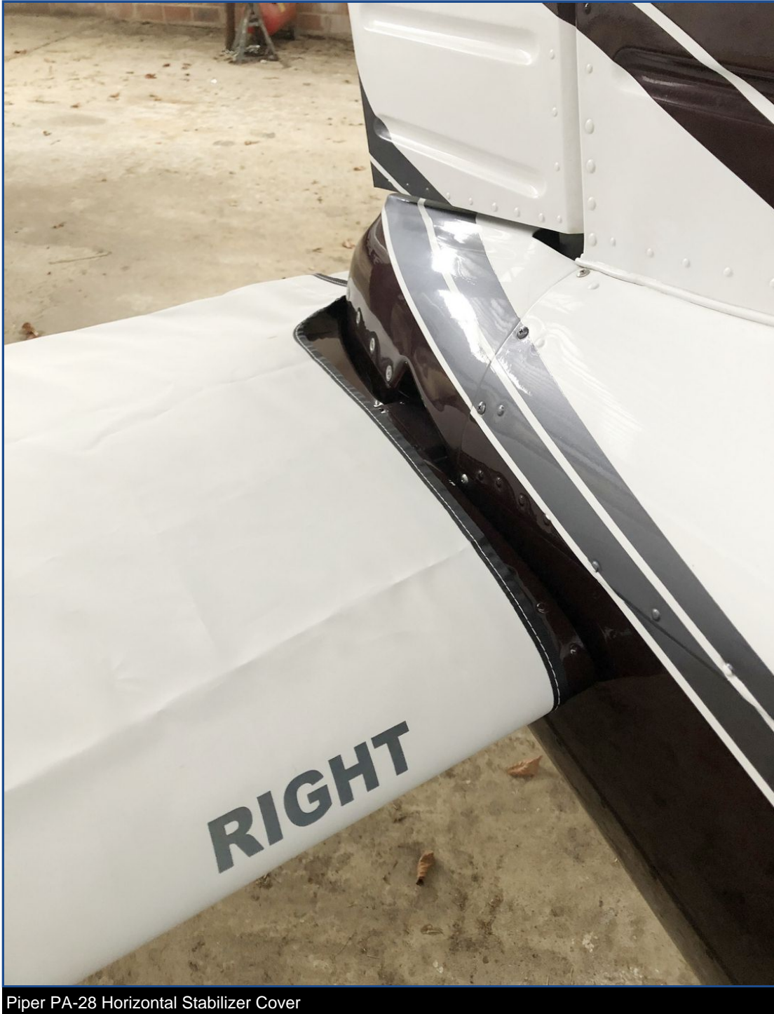
Piper PA-28 Horizontal Stabilizer Cover