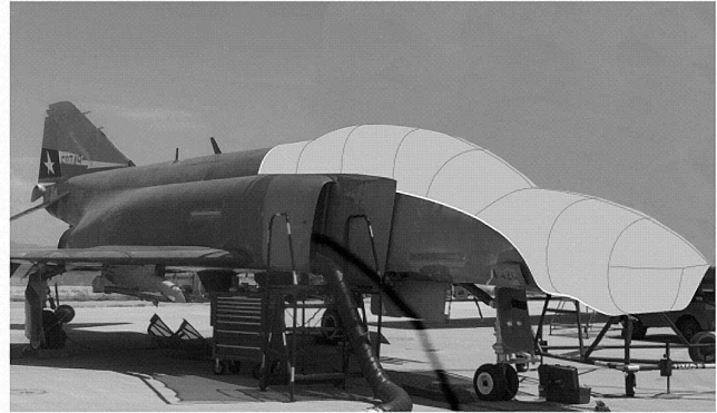
F4 Phantom Canopy/Nose Cover