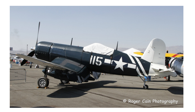
Chance Vought F4U Corsair