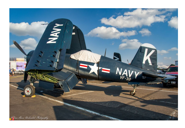
Chance Vought F4U Corsair Canopy Cover