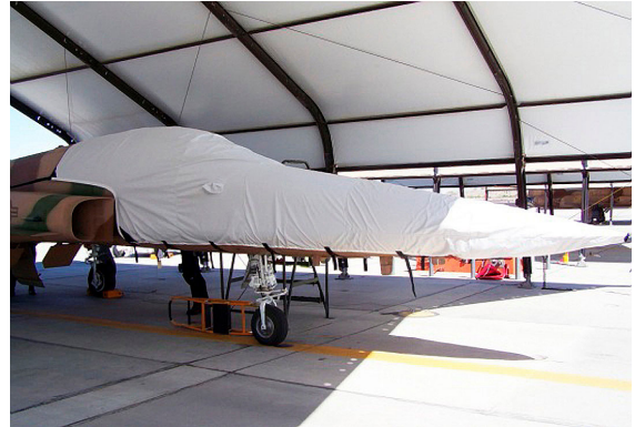
Northrup F-5 Talon Canopy/Nose Cover