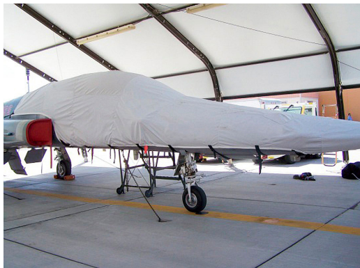
Northrup F5 Talon Canopy Cover

This cover type is made from Silver Acrylic Sunbrella canvas and is 100% lined with a soft and smooth microfiber. Bruce's Custom Covers developed this material combination especially for aircraft protection. The outer material is medium weight and treated for water resistance, UV resistance and anti-static buildup. The inner lining is a very soft and smooth microfiber to prevent scratching. The material is very reflective, and tests show that the cabin interior temperature can be reduced to near-ambient temperature on the hottest of days. It is water, ice and snow repellent, yet breathable to allow moisture to escape from between the cover and the aircraft surface.