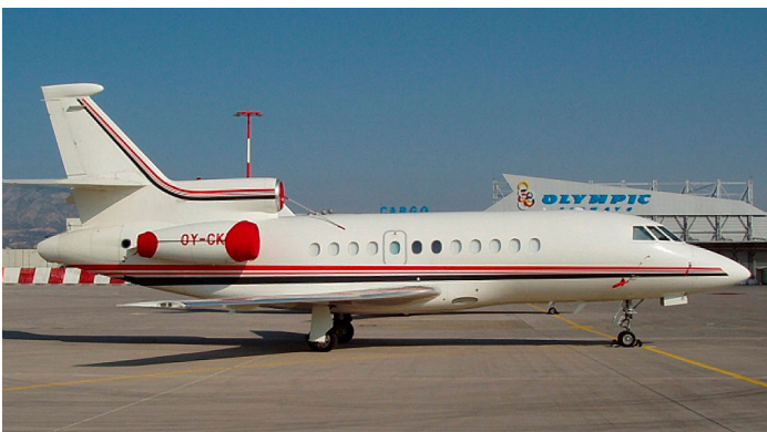
Falcon 900 Engine Covers

The Falcon Jet 50EX Bikini Style Engine Covers are a single-piece design using a soft and smooth stretchy and fabric. The cover stretches tightly over both the intake and exhaust, installing quickly and easily. These covers are designed to be used as hangar dust covers and have a useful life of approximately one year.