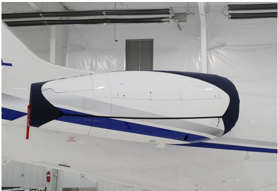
Challenger 300 Intake/Exhaust Cover Set, 3-strap type