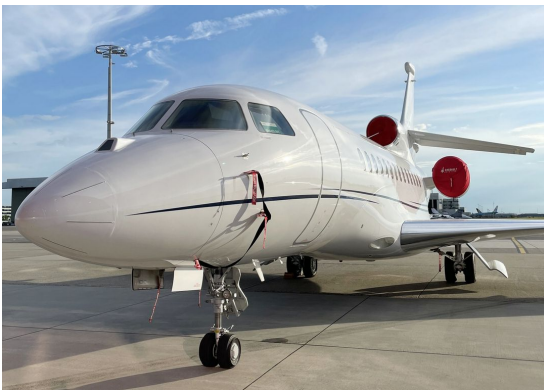
Falcon 7X Engine Cover Set, Pitot Covers

The Falcon Jet 7X Intake Covers are designed to install easily yet be completely storable. A spring steel hoop is sewn into the hem of each cover, allowing them to be installed without climbing onto the wing or using a stepladder. To store the covers the spring steel hoop folds like a band-saw blade into three nesting rings. Each cover folds into a compact circular bundle which is stored in the included duffle bag, yet they unfold quickly for use. The Tri-Fold Ring cover is made of medium weight nylon which is available in a variety of colors to match the paint trim. Each cover set comes complete with installation and folding instructions. The aircraft's registration number can be silkscreened onto the cover for an extra charge.