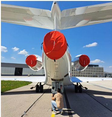
Falcon Jet 7X Intake/Exhaust Covers

The Falcon Jet 7X Intake Covers are designed to install easily yet be completely storable. A spring steel hoop is sewn into the hem of each cover, allowing them to be installed without climbing onto the wing or using a stepladder. To store the covers the spring steel hoop folds like a band-saw blade into three nesting rings. Each cover folds into a compact circular bundle which is stored in the included duffle bag, yet they unfold quickly for use. The Tri-Fold Ring cover is made of medium weight nylon which is available in a variety of colors to match the paint trim. Each cover set comes complete with installation and folding instructions. The aircraft's registration number can be silkscreened onto the cover for an extra charge.