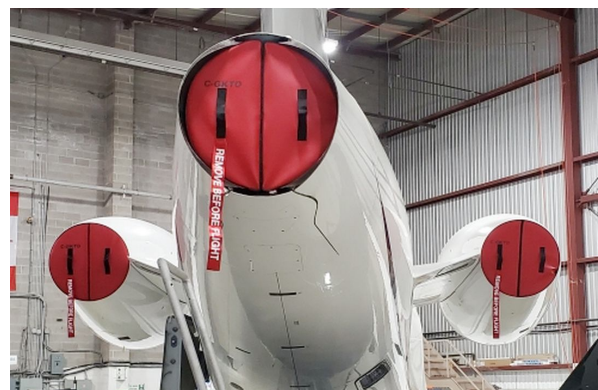
Falcon F7X Exhaust Plugs