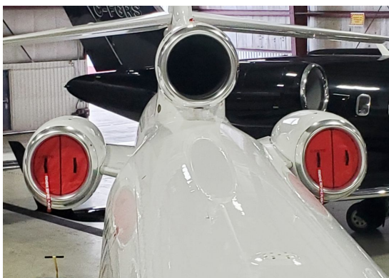
Falcon F7X Outboard Intake Plugs

The Engine Inlet Plugs are custom fit for your Falcon Jet 7X intakes, made with heavy-duty vinyl material, and stuffed with a single block of sculpted urethane foam. Each plug has a zipper that allows the foam to be removed and dried if necessary. Engine plugs have 'remove before flight' streamers sewn onto the face of the plugs. Most plugs are imprinted with the aircraft registration number in black for an extra charge. Storage bag NOT included. Engine plugs may be inserted after flight when the engine is still warm. Engine Inlet Plugs are commonly referred to as Cowl Plugs, Intake Plugs, Cowl Blocks, Engine Blocks, and Engine Bungs.