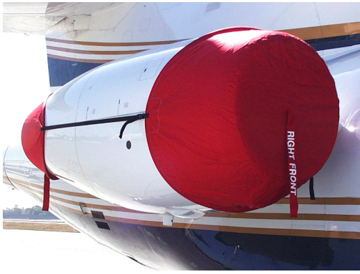
Falcon 50 Outboard Engine Cover