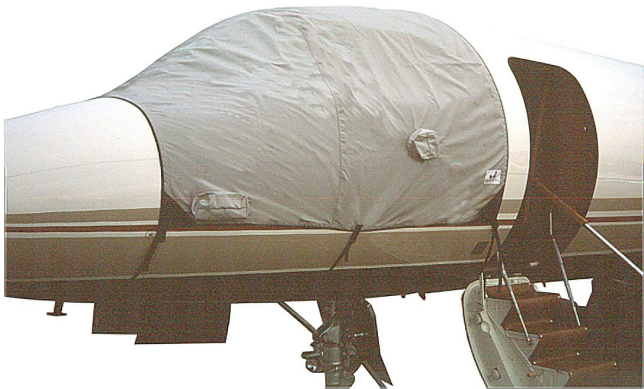
Falcon 50 Windshield Cover

This cover type is made from Silver Acrylic Sunbrella canvas and is 100% lined with a soft and smooth microfiber. Bruce's Custom Covers developed this material combination especially for aircraft protection. The outer material is medium weight and treated for water resistance, UV resistance and anti-static buildup. The inner lining is a very soft and smooth microfiber to prevent scratching. The material is very reflective, and tests show that the cabin interior temperature can be reduced to near-ambient temperature on the hottest of days. It is water, ice and snow repellent, yet breathable to allow moisture to escape from between the cover and the aircraft surface.