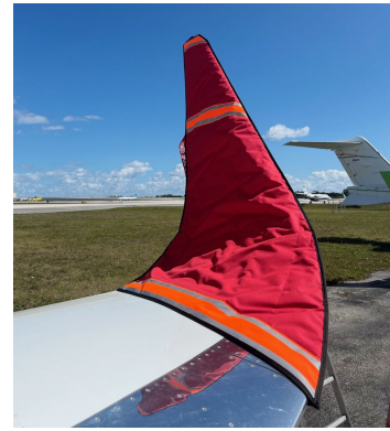
Falcon Jet 900 Winglet Padding Covers