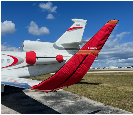
Falcon Jet 900 Winglet Padding Covers