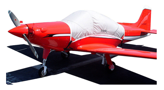
Falco Canopy Cover & Engine Plugs

This cover type is made from Silver Acrylic Sunbrella canvas and is 100% lined with a soft and smooth microfiber. Bruce's Custom Covers developed this material combination especially for aircraft protection. The outer material is medium weight and treated for water resistance, UV resistance and anti-static buildup. The inner lining is a very soft and smooth microfiber to prevent scratching. The material is very reflective, and tests show that the cabin interior temperature can be reduced to near-ambient temperature on the hottest of days. It is water, ice and snow repellent, yet breathable to allow moisture to escape from between the cover and the aircraft surface.