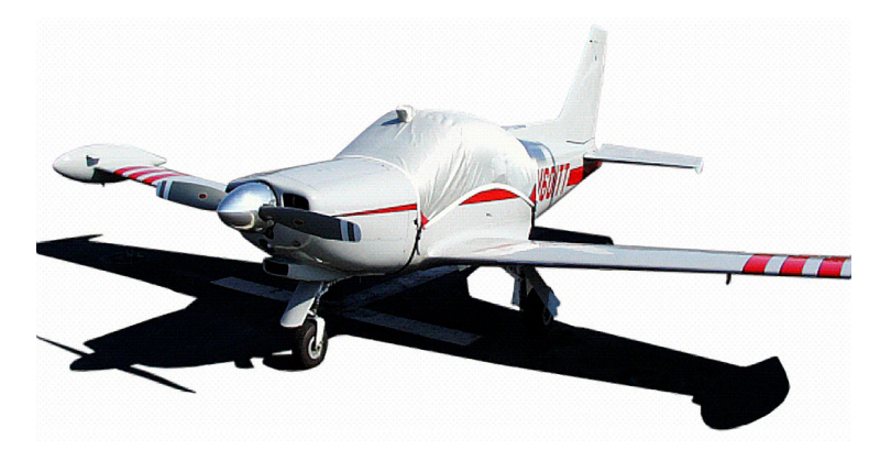
The Falco Canopy Cover is similar to the design for the Siai Marchetti SF260