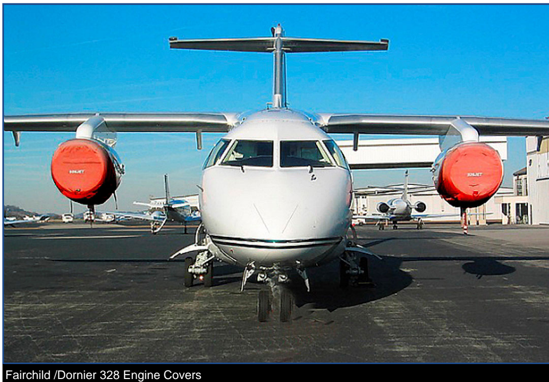
Fairchild /Dornier 328 Engine Covers