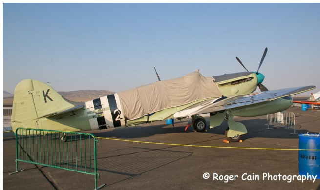
Fairey Firefly Canopy Cover