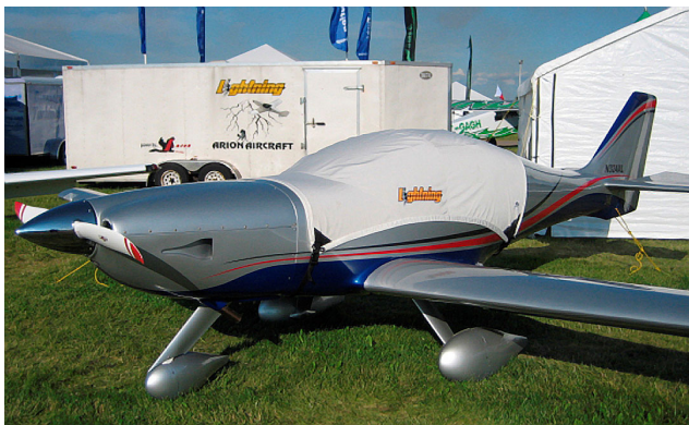
Lightning Canopy Cover