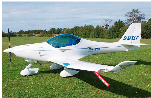
Covers & Plugs for the FK-14 Polaris