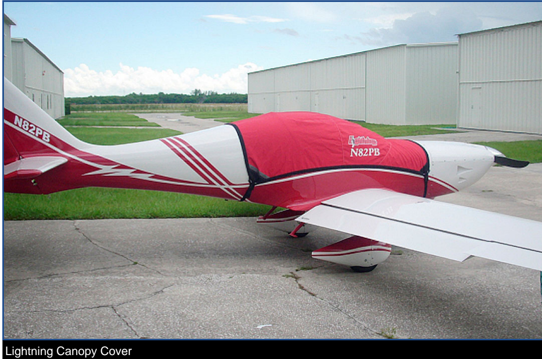
Lightning Canopy Cover