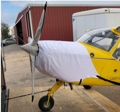
FK-9 Engine Cover, test fit cover