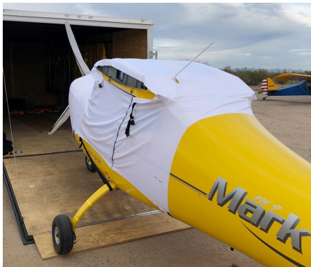
FK-Lightplanes FK-9 Canopy Cover, test fit cover

This cover type is made from Silver Acrylic Sunbrella canvas and is 100% lined with a soft and smooth microfiber. Bruce's Custom Covers developed this material combination especially for aircraft protection. The outer material is medium weight and treated for water resistance, UV resistance and anti-static buildup. The inner lining is a very soft and smooth microfiber to prevent scratching. The material is very reflective, and tests show that the cabin interior temperature can be reduced to near-ambient temperature on the hottest of days. It is water, ice and snow repellent, yet breathable to allow moisture to escape from between the cover and the aircraft surface.