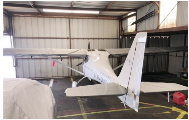
FK 9 MARK IV Wing & Horizontal Stabilizer Dust Covers