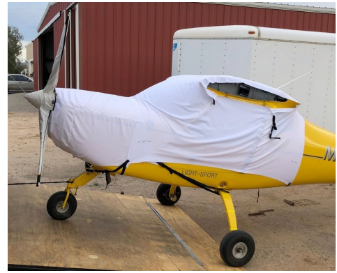
FK-Lightplanes FK-9 Canopy & Engine Covers, test fit covers