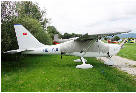
Glstar Canopy, Wings, Horizontal Stab. & Prop Covers