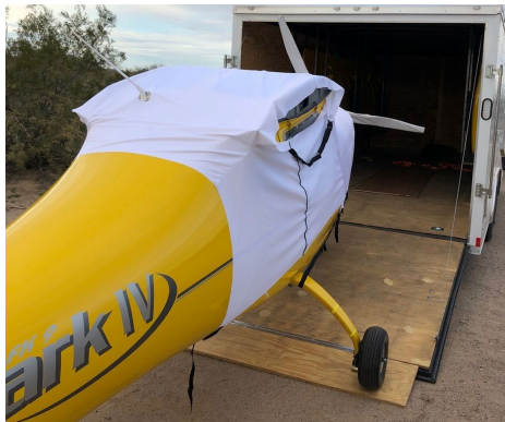
FK-Lightplanes FK-9 Canopy Cover, test fit cover