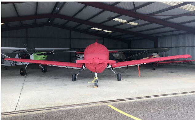
FLS Club Sprint Empennage Cover (Tailboom, Vertical & Horiz Stabilizers) All Year Use

Engine Covers will cinch around or behind the spinner, cover the entire engine cowl area including the engine air cooling and induction air inlets, and fastens together with Velcro beneath the spinner down the front of the cowling. The Engine Cover is attached with a belly strap aft of the firewall, and can Velcro to the Canopy Cover. Engine Covers are normally made from Solution-Dyed Polyester or Acrylic Sunbrella . An Insulated version of the engine cover can be made with a thicker, quilted, and water-repellent material. The Insulated Engine Cover works well in cold climates to help with engine preheating.