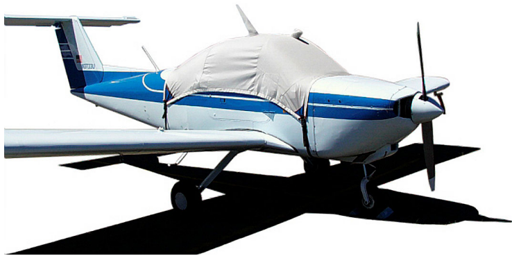
Canopy Cover for Beech Skipper

Covers developed this material combination especially for aircraft protection. The outer material is medium weight and treated for water resistance, UV resistance and anti-static buildup. The inner lining is a very soft and smooth microfiber to prevent scratching. The material is very reflective, and tests show that the cabin interior temperature can be reduced to near-ambient temperature on the hottest of days. It is water, ice and snow repellent, yet breathable to allow moisture to escape from between the cover and the aircraft surface.